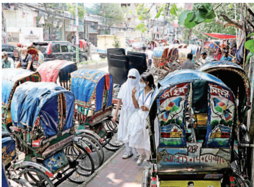
Two schoolgirls squeeze through a narrow space on a footpath, which has been occupied by parked rickshaws. Not just the footpath, a part of the road beside it has become a parking spot for the three-wheelers, leaving no room for pedestrians to walk with ease. This photo was taken on Green Road yesterday.