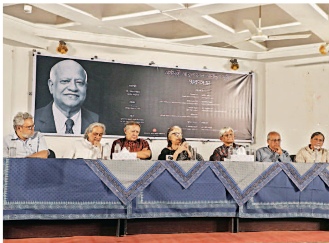
Speakers at a memorial event in remembrance of former finance minister Abul Maal Abdul Muhith, organised by Gyantapas Abdur Razzaq Foundation at Dhaka University yesterday.