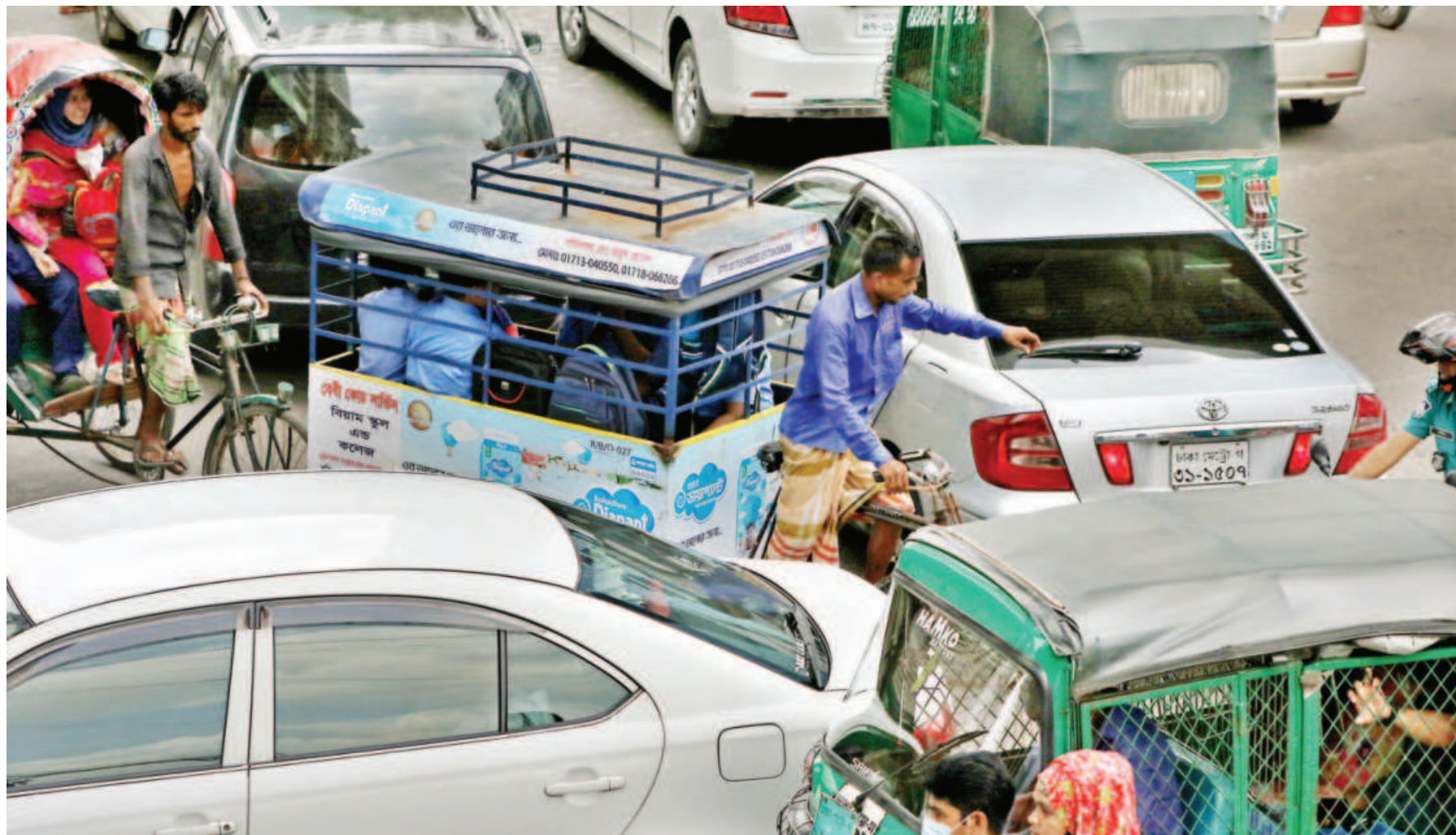
At the Bangla Motor intersection, a school van filled with children was spotted going the wrong way from Eskaton yesterday. Following the van driver's illegal manoeuvre, a rickshaw-puller does the same, riding closely behind him. This risky step not only puts their lives at stake, but also increases the chance of accidents on the busy road.