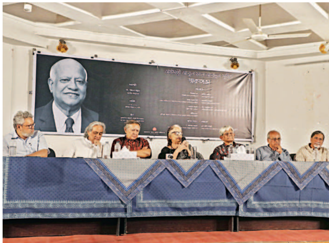
Speakers at a memorial event in remembrance of former finance minister Abul Maal Abdul Muhith, organised by Gyantapas Abdur Razzaq Foundation at Dhaka University yesterday.