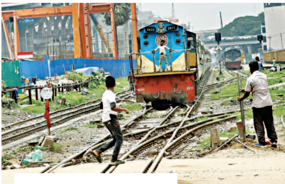
Pedestrians walking across the rail lines at a level crossing in the capital's Tejjgaon even though the train is just yards away and the bars have been lowered. People often take such unnecessary risks just to save a minute.