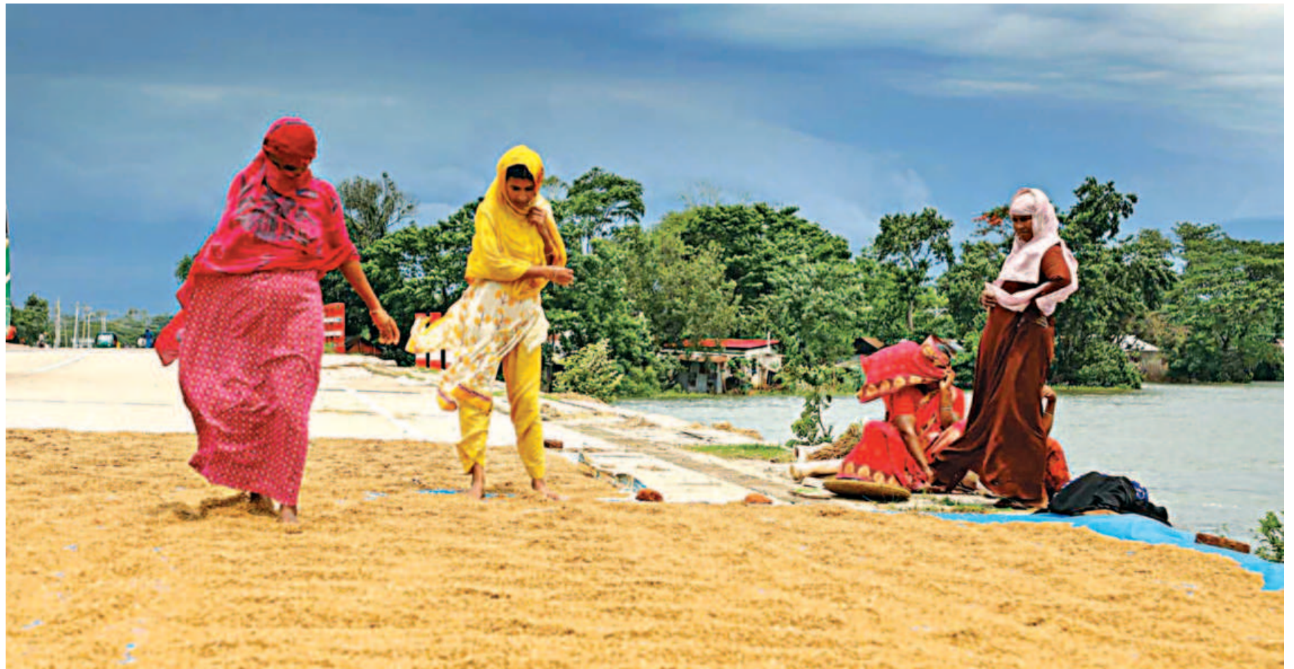
Women try to dry paddy in front of M Saifur Rahman College in Companiganj of Sylhet yesterday as dark clouds gather. Boro harvest and the processing of the paddy have been hampered this year largely due to early floods and inclement weather.

The tax was 10 percent in fiscal 2020-21 and there was