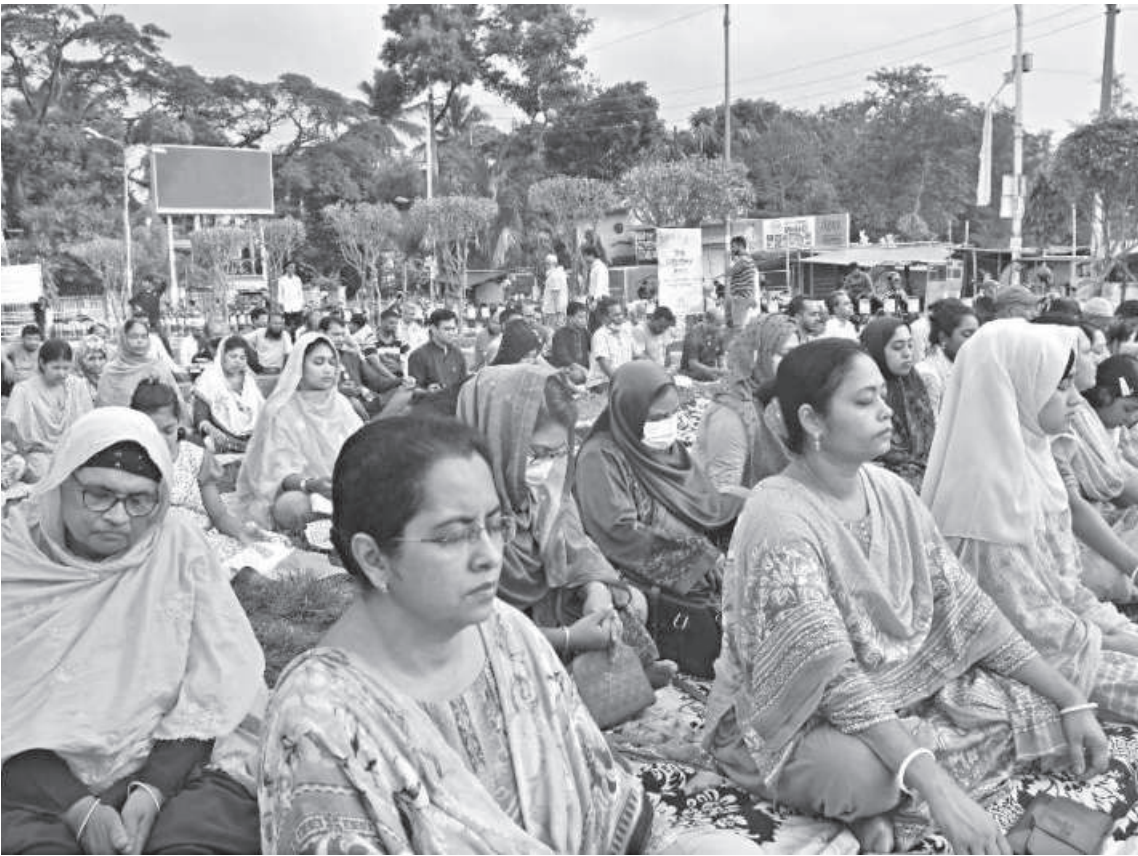
People from all walks of life and age meditate on the premises of Barishal's Bangabandhu Udyan yesterday, marking World Meditation Day. The event was organised by Quantum Foundation.

The parliamentary committee appreciated the US humanitarian and political support extended to Bangladesh on the Rohingya issue.