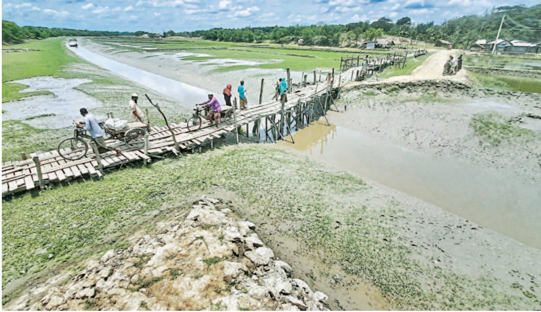
Sedimentation has reduced water depth in the Bhadra to such an extent that it barely looks like a river. The authorities spent crores of taka only two years ago to dredge the river. The photo was taken recently in Kharnia area of Dumuria, Khulna.