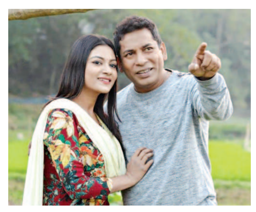
A snippet from 'Ronger Manush Dhonger Manush'.