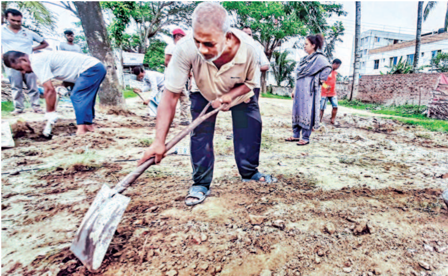
Khulna's Sheikh Abu Naser bypass road, from Bastuhara intersection to City bypass, was left unfit to use for 12 long years. Locals tried multiple times to get the authorities to fix the road but to no avail. After many years of suffering, they have started renovating the road on their own.