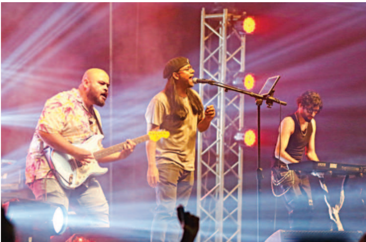
Thousands of band music lovers flocked to see "The Hybrid Experience" yesterday, featuring Artcell, Black, Cryptic Fate, Arbovirus, Nemesis, AvoidRafa, Mechanix, and Dreek. The concert was organised by Full Circle with Daraz BD as the title sponsor.