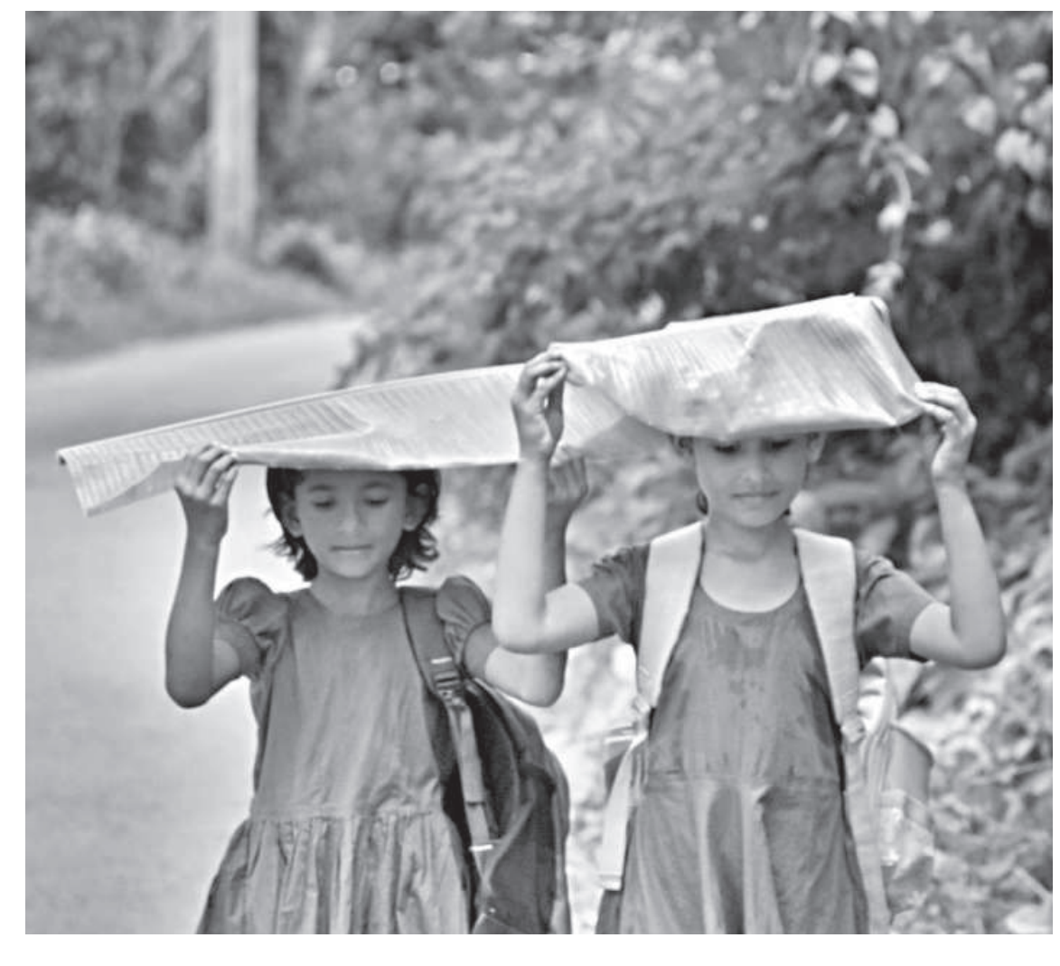
While walking home, two school-going children take refuge under banana leaves to escape from the sun's heat. This photo was taken on Thursday from Jhalakathi's Sholposena village.

2680 sft ALL 3 Bed, Bath & Balcony, Drawing, Separate Lounge, Kitchen. Servant Room & Bathroom, Generator, Lift, Gas & Parking, Road-35, House-1B, Flat-F3, Gulshan-02, Dhaka-1207 Contact-01976407304