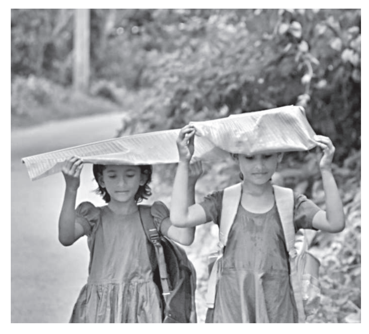
While walking home, two school-going children take refuge under banana leaves to escape from the sun's heat. This photo was taken on Thursday from Jhalakathi's Sholposena village.

2680 sft ALL 3 Bed, Bath & Balcony, Drawing, Separate Lounge, Kitchen. Servant Room & Bathroom, Generator, Lift, Gas & Parking, Road-35, House-1B, Flat-F3, Dhaka-1207 Gulshan-02, Contact-01976407304