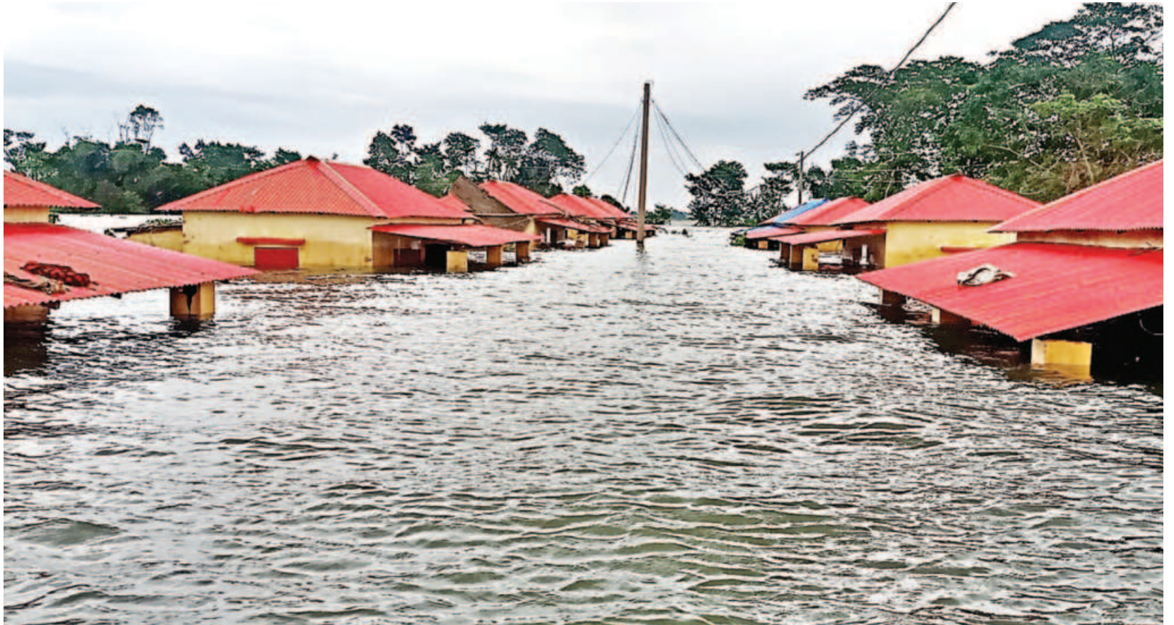
Houses of Asrayan project are almost submerged in flood waters in Radhanagar of Sylhet's Companiganj upazila. Many residents have taken refuge at their relatives' homes far away as there is no room left at the shelter centres nearby. Around 20 lakh people have been affected by the flash floods in Sylhet and Sunamganj. The photo was taken yesterday. Story on page 12.