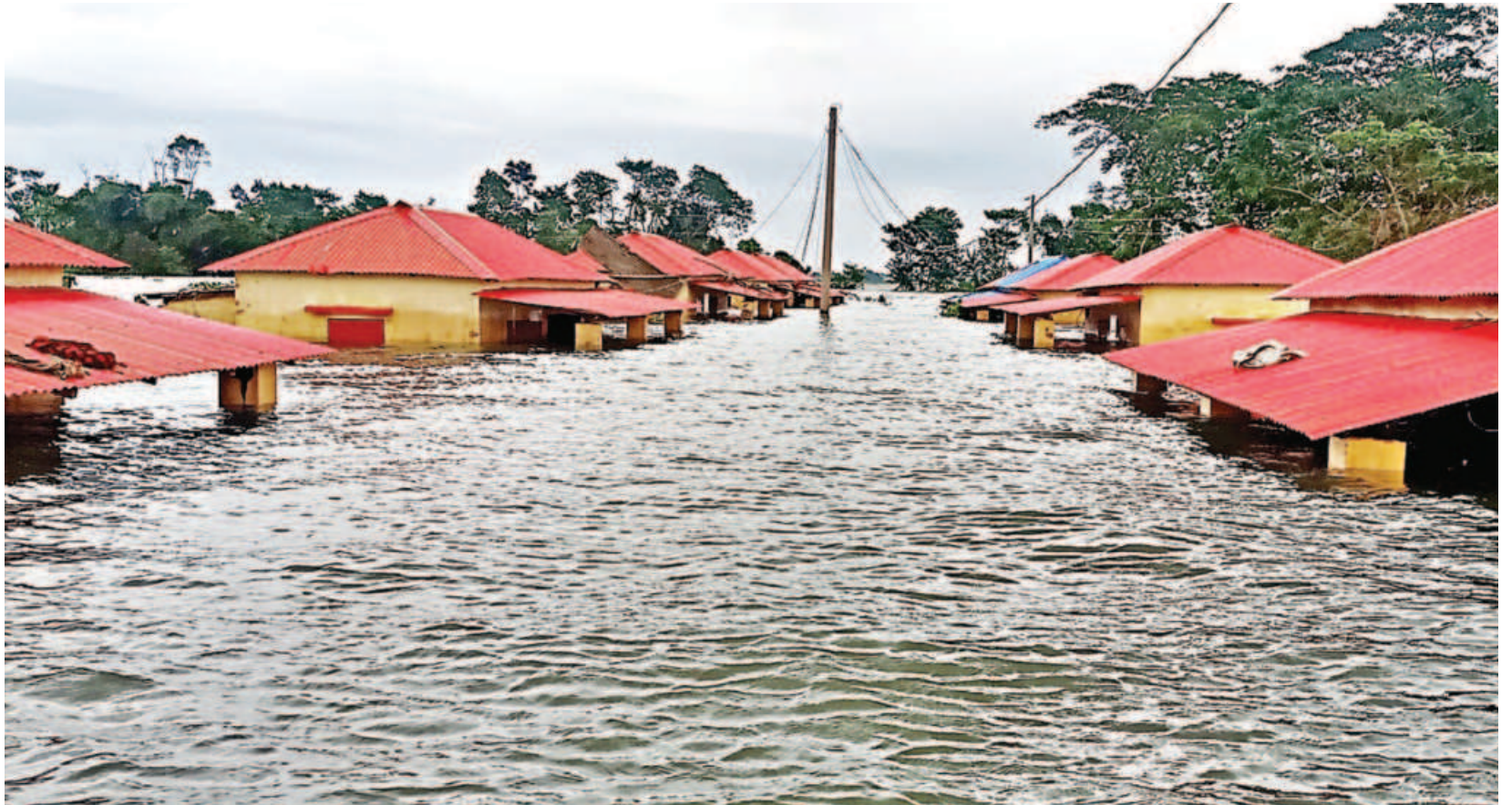
Houses of Asrayan project are almost submerged in flood waters in Radhanagar of Sylhet's Companiganj upazila. Many residents have taken refuge at their relatives' homes far away as there is no room left at the shelter centres nearby. Around 20 lakh people have been affected by the flash floods in Sylhet and Sunamganj. The photo was taken yesterday.