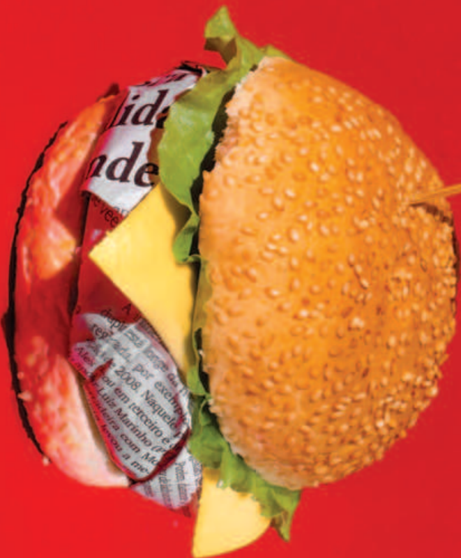
ILLUSTRATION: ZARIF FAIAZ