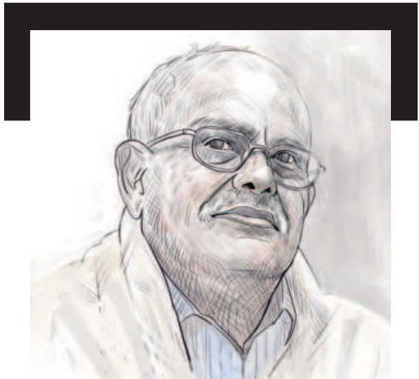
ABDUL GAFFAR CHOWDHURY 1934-2022