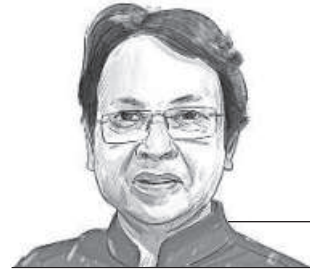
Golam Mortoza is the editor of The Daily Star Bangladesh.