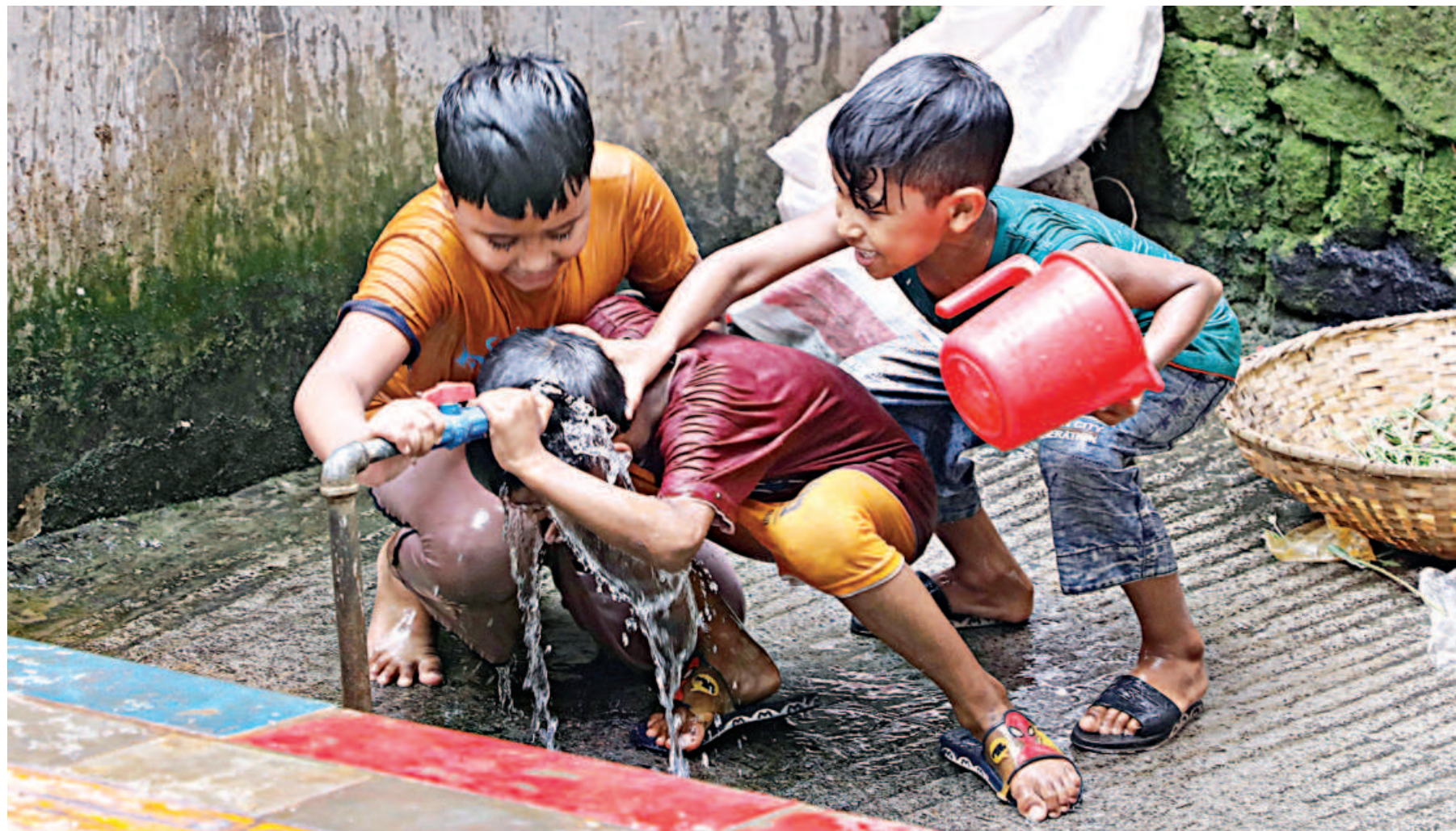
Even though they just wanted to get some relief from the summer swelter, these three, being kids, turned this mundane event of cooling themselves off using a public tap into a fun activity by splashing water at each other. This photo was taken in Old Dhaka's Lalbagh area.

Although all illegal kilns in four districts -- Gazipur, Manikganj, Dhaka and Munshiganj -- have been evicted, some 97 of them are still running in Narayanganj and polluting the environment.