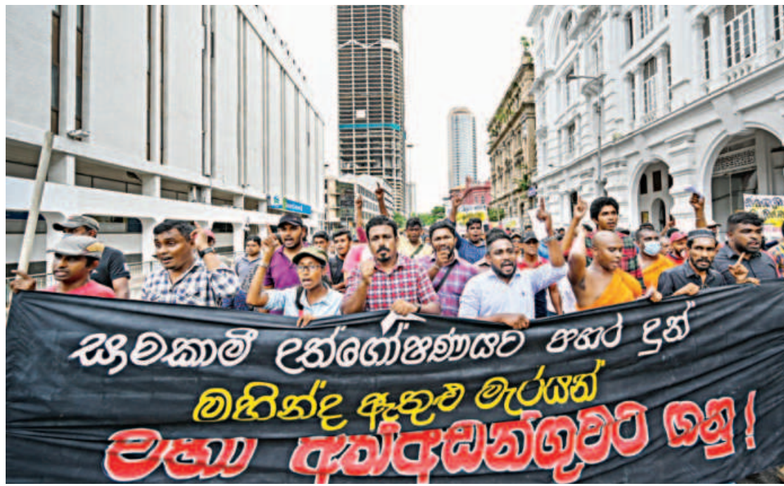
Protesters take part in an anti-government demonstration outside the Sri Lanka police headquarters in Colombo yesterday, demanding the arrest of government supporters who allegedly assaulted peaceful demonstrators amid ongoing economic crisis.

In Haryana, Gurgaon recorded the highest temperature yesterday amongst other stations which are 48.1 degrees Celsius and Mukhtsar in Punjab reported 47.4 degrees Celsius.