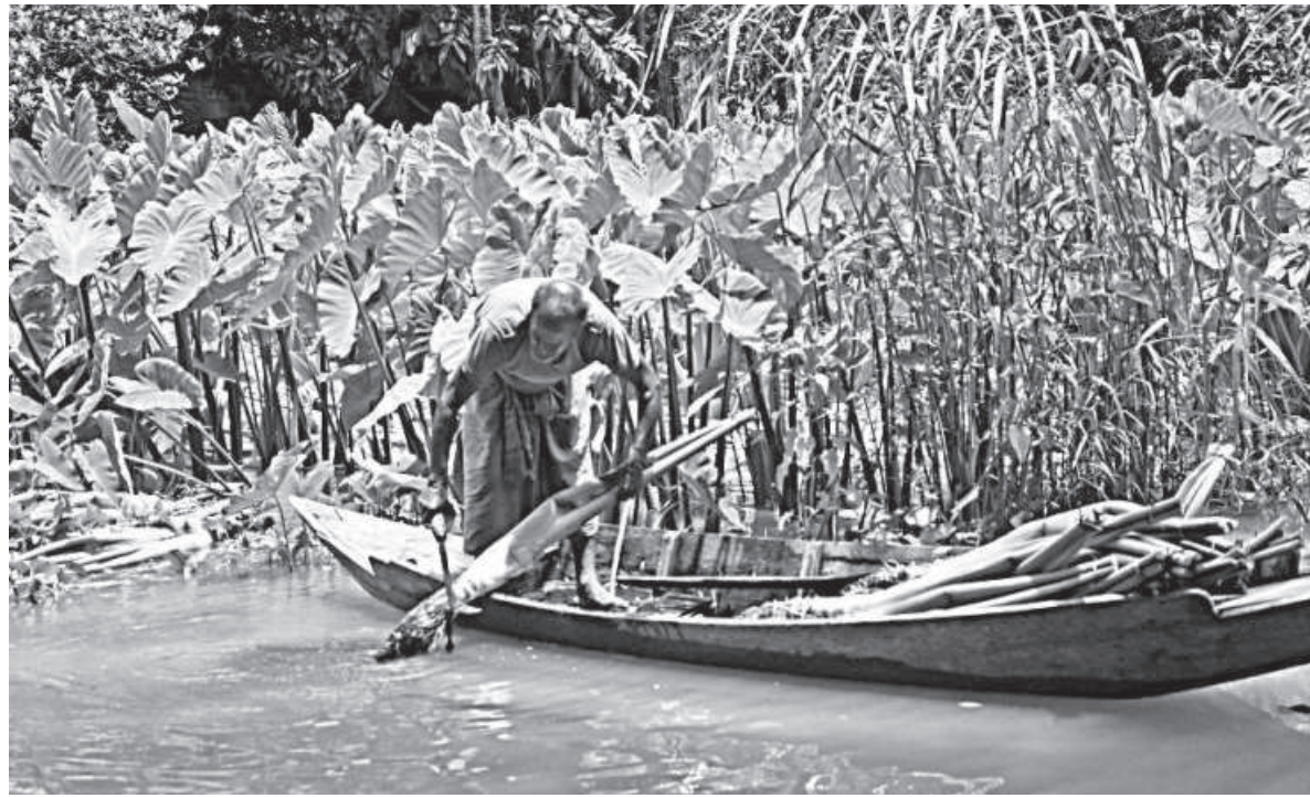
Standing on his small boat, a man cleans off the roots of water taro (pani kochu), which tends to grow on the bank of canals and other waterbodies. After collecting them, he sells the different sized taro at local markets, earning Tk 500 per day. This photo was taken yesterday at Barishal's Harta village.

"We still have all the facilities developed in the hospital for treating Covid-19 patients. If situation demands, we can reopen everything," the hospital director said.