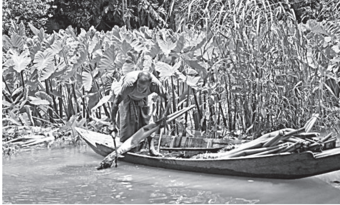
Standing on his small boat, a man cleans off the roots of water taro (pani kochu), which tends to grow on the bank of canals and other waterbodies. After collecting them, he sells the different sized taro at local markets, earning Tk 500 per day. This photo was taken yesterday at Barishal's Harta village.

"We still have all the facilities developed in the hospital for treating Covid-19 patients. If situation demands, we can reopen everything," the hospital director said.