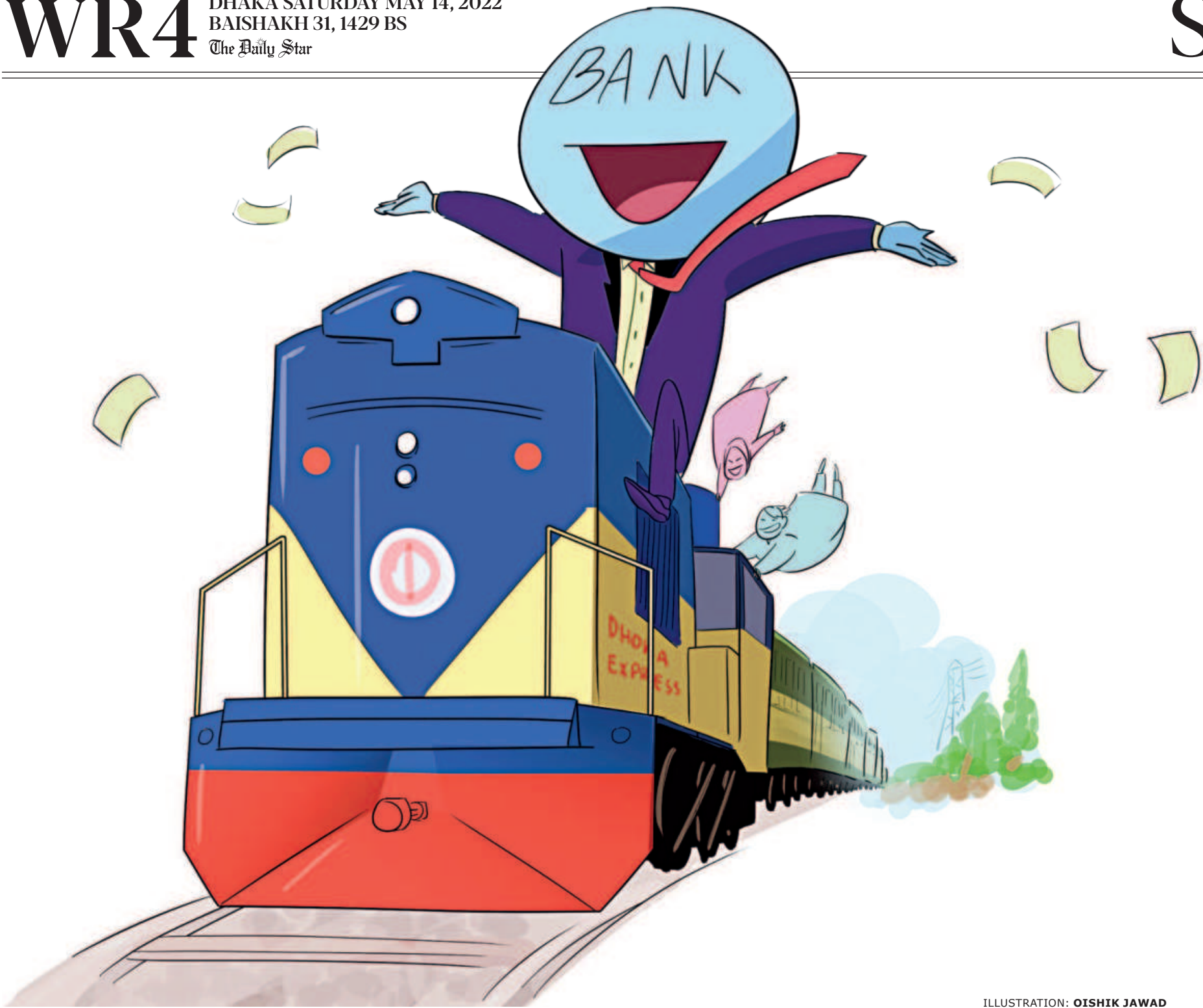
ILLUSTRATION: OISHIK JAWAD