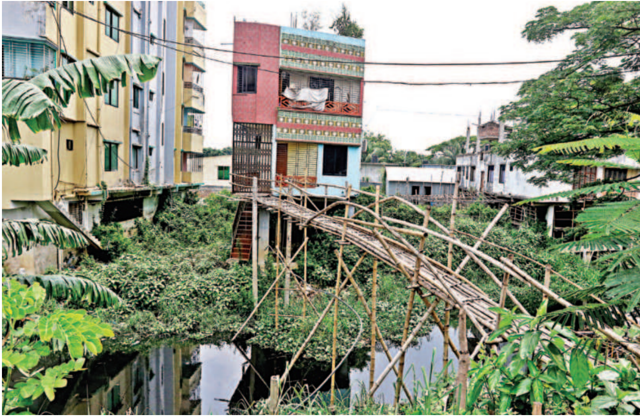
A two-storey building stands on a wetland in the capital's Nandipara. A makeshift bamboo bridge is the only way for its residents to get in and out of home. Many other landlords in the area have put up such risky structures, showing complete disregard for the safety of the residents. The photo was taken yesterday.

In March, the prices of oil catapulted to a 14-year high and those of