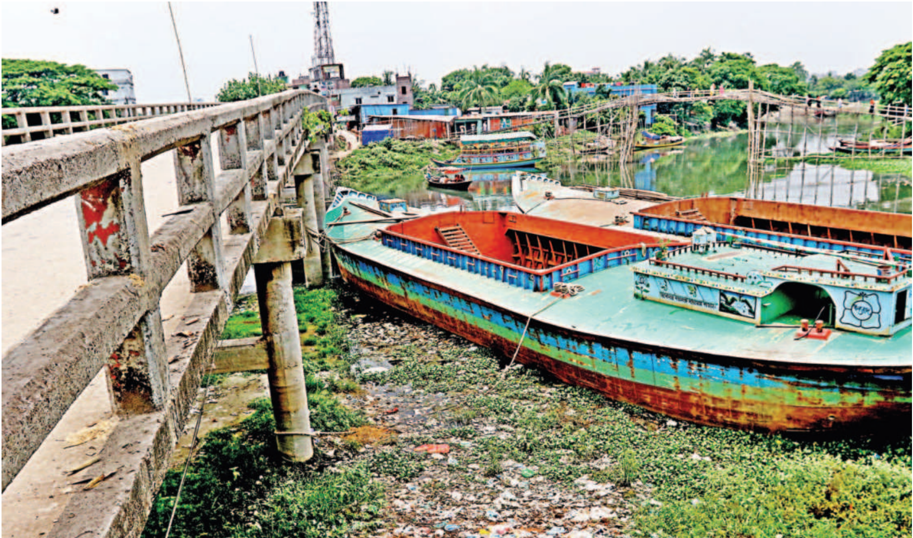
Large vessels are tied to the pillars of a bridge at Trimohony, Khilgaon, in the capital. Civil engineers say this practice can damage the bridge because the pillars are not designed to withstand the pull of such vessels.