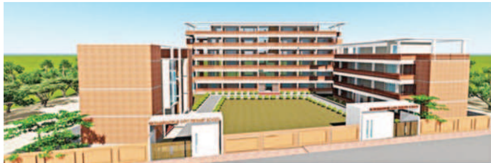
The proposed design of the six-storied Mohammadpur Govt Primary School.

Beautification of primary schools underway to improve education quality