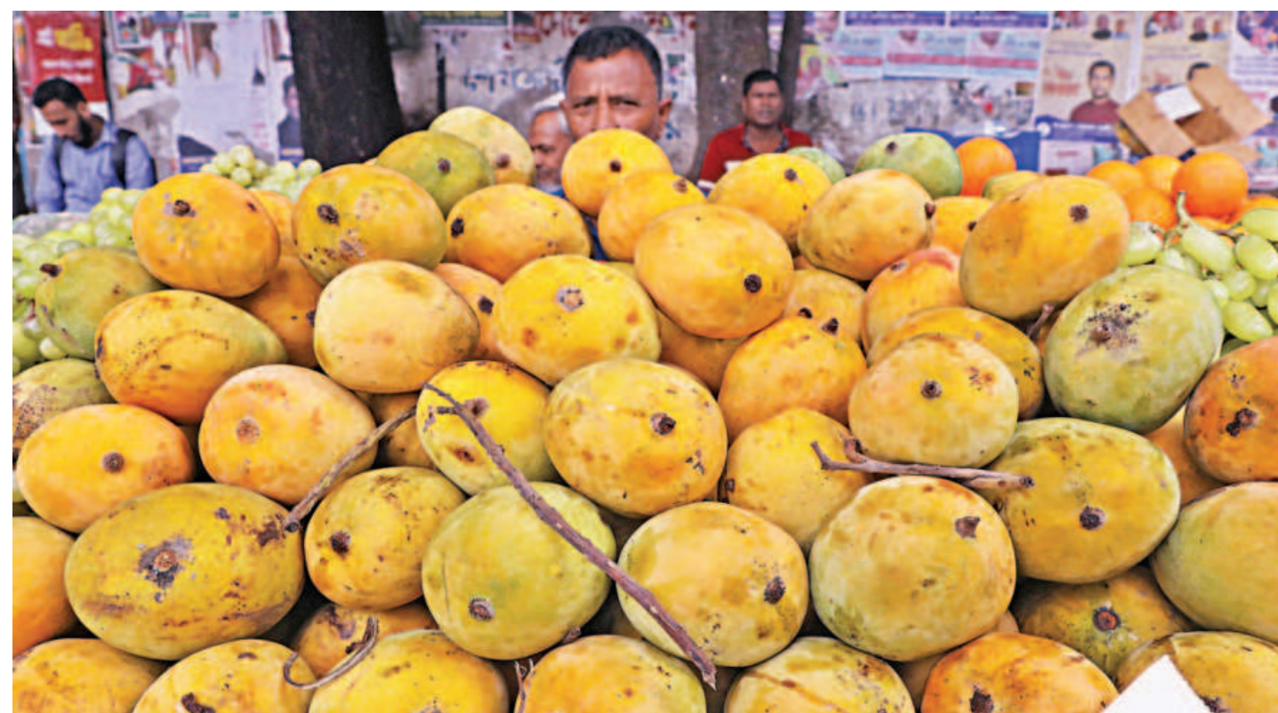
One of the things that makes the scorching summer heat bearable is the expectation of mangoes. Lately, the city's markets were seen filled with different varieties of the fruit cultivated all over the country. This vendor, for example, was spotted in Gulistan yesterday selling Gobindobhog mangoes for Tk 100 per kilo.