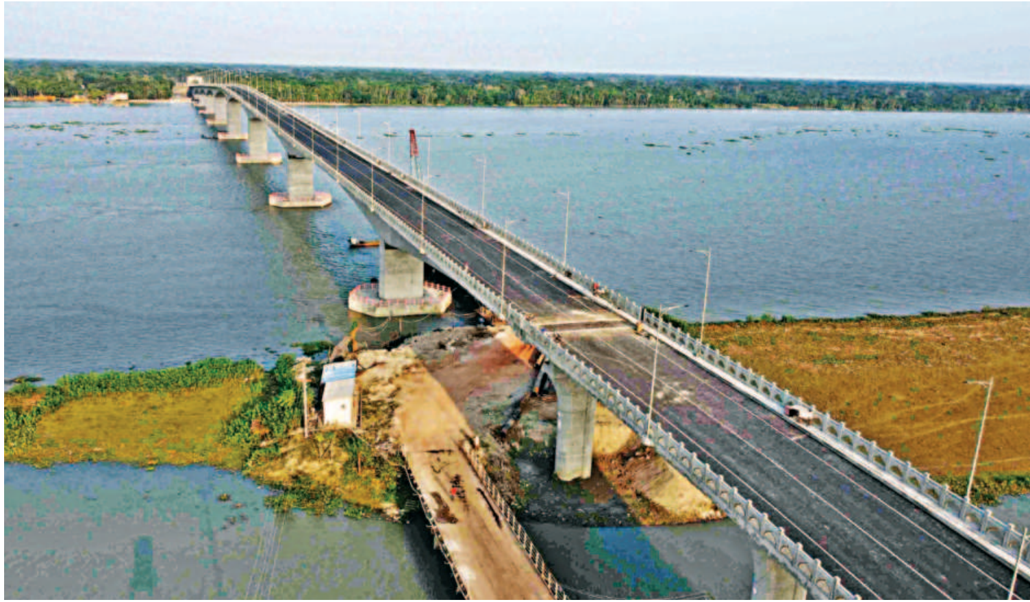
The construction of the 8th Bangladesh-China Friendship Bridge over the Kacha river in Pirojpur is nearing completion. The contractor, China Railway 17th Bureau Groups Co Ltd, will hand over the bridge to the Roads and Highways Department late next month. Built at a cost of Tk 889 crore, the 998-metre structure will establish direct road links between Pirojpur and four other districts -- Barishal, Jhalakathi, Barguna and Patuakhali. The photo was taken on Sunday.

B1 Submarine cable business now open for private firms