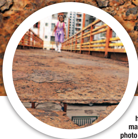
The foot-over bridge in front of Azimpur Government Girls' School & College is in a dilapidated state. Rust and holes have formed all over and the metal sheets have detached from the welding in many places. Fearing risk of accidents, many have stopped using the bridge, but some students still use it to cross the road as there is no footbridge nearby. This photo was taken yesterday.