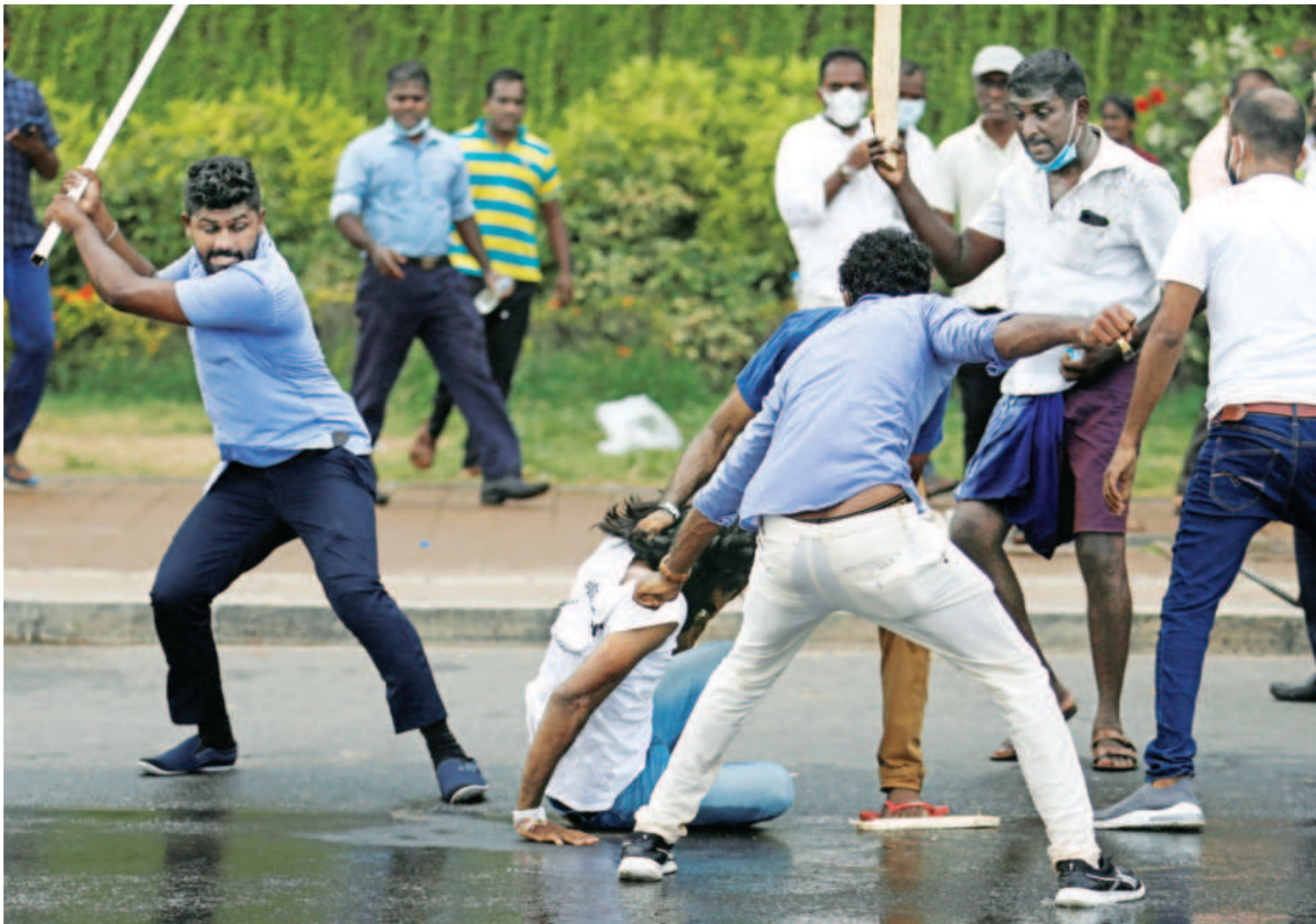
Supporters of Sri Lanka's ruling party hold down and beat up an anti-government demonstrator during a clash between the two groups, amid the country's economic crisis, in Colombo yesterday.