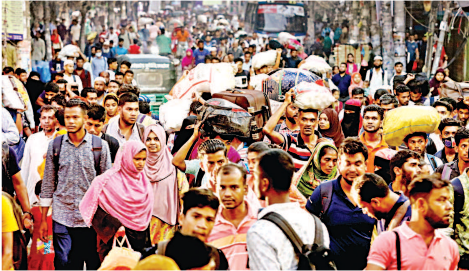
Thousands of people returning to the capital after the holidays walking out of Sadarghat launch terminal yesterday morning. Most of them had to walk for a long time before they could find any vehicle to go to their destinations.