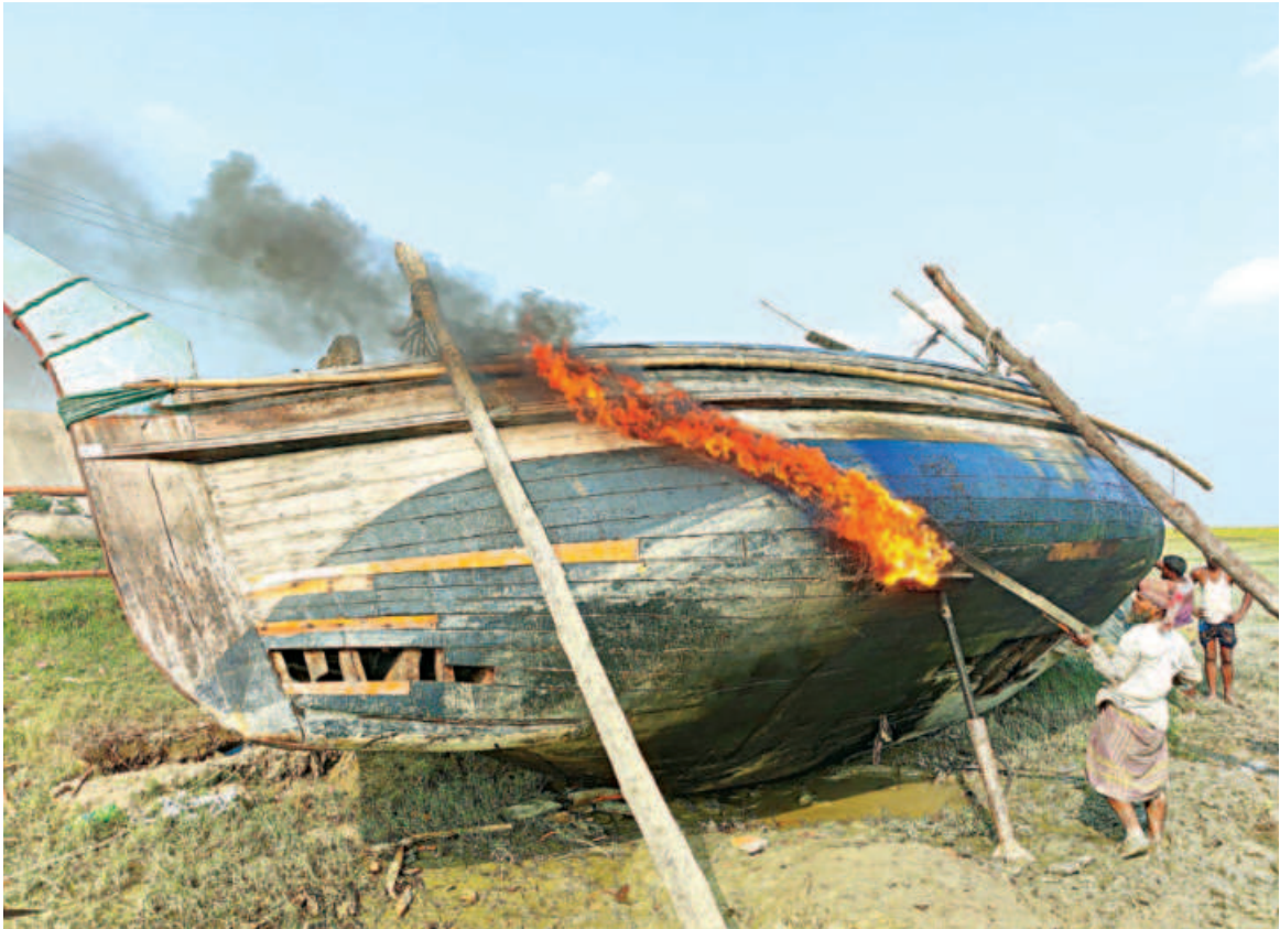
Fishermen using fire to melt tar and fill the holes in their boat at Kazirhat of Bhola's Doulatkhan yesterday. They are preparing their vessel as the hilsa fishing ban has been lifted and they could go out to the sea and rivers to catch the national fish.