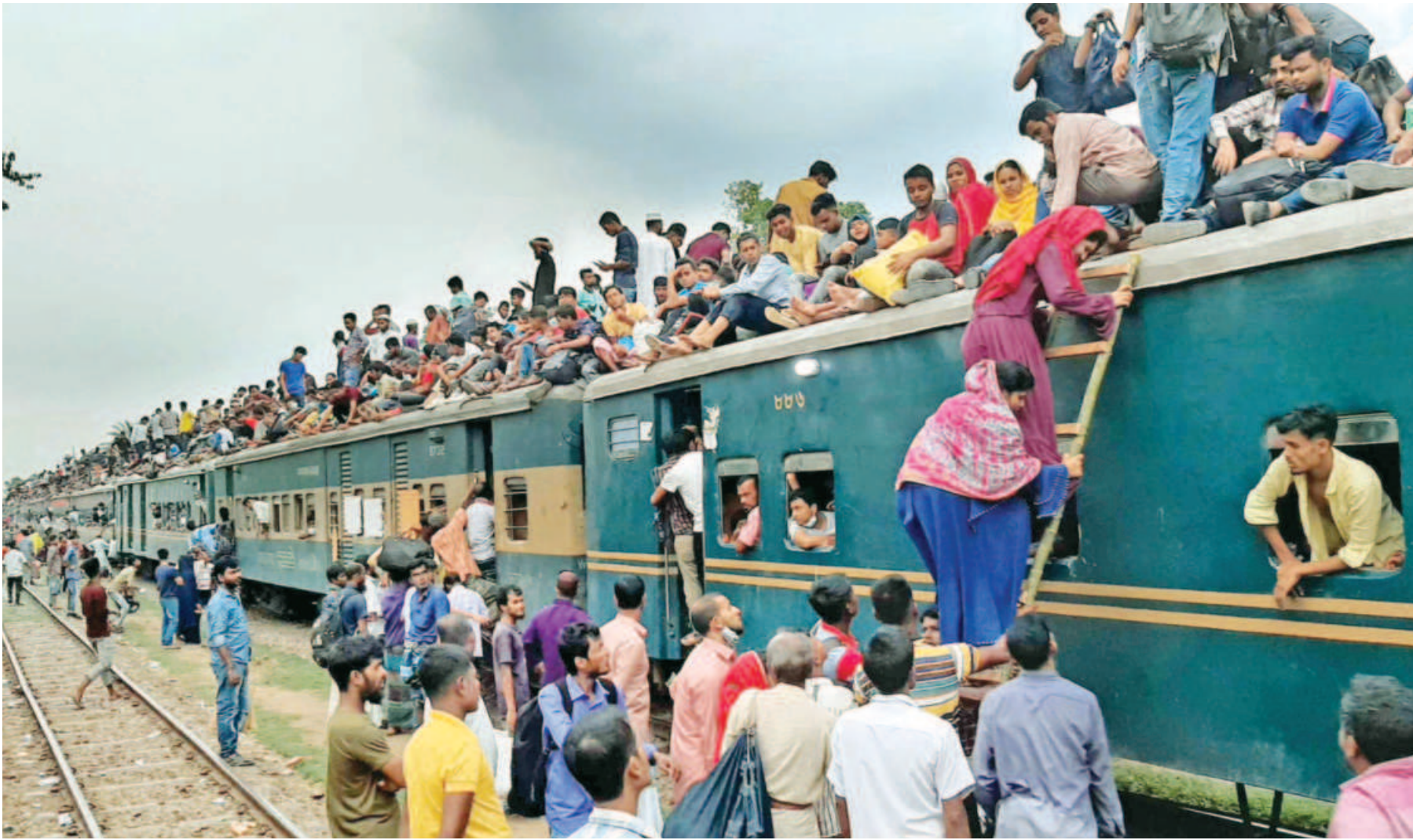
Ignoring government directives and their own safety, people are climbing to a train roof to get to their homes ahead of Eid-ul-Fitr. The photo was taken at Gazipur's Sreepur Railway Station yesterday.