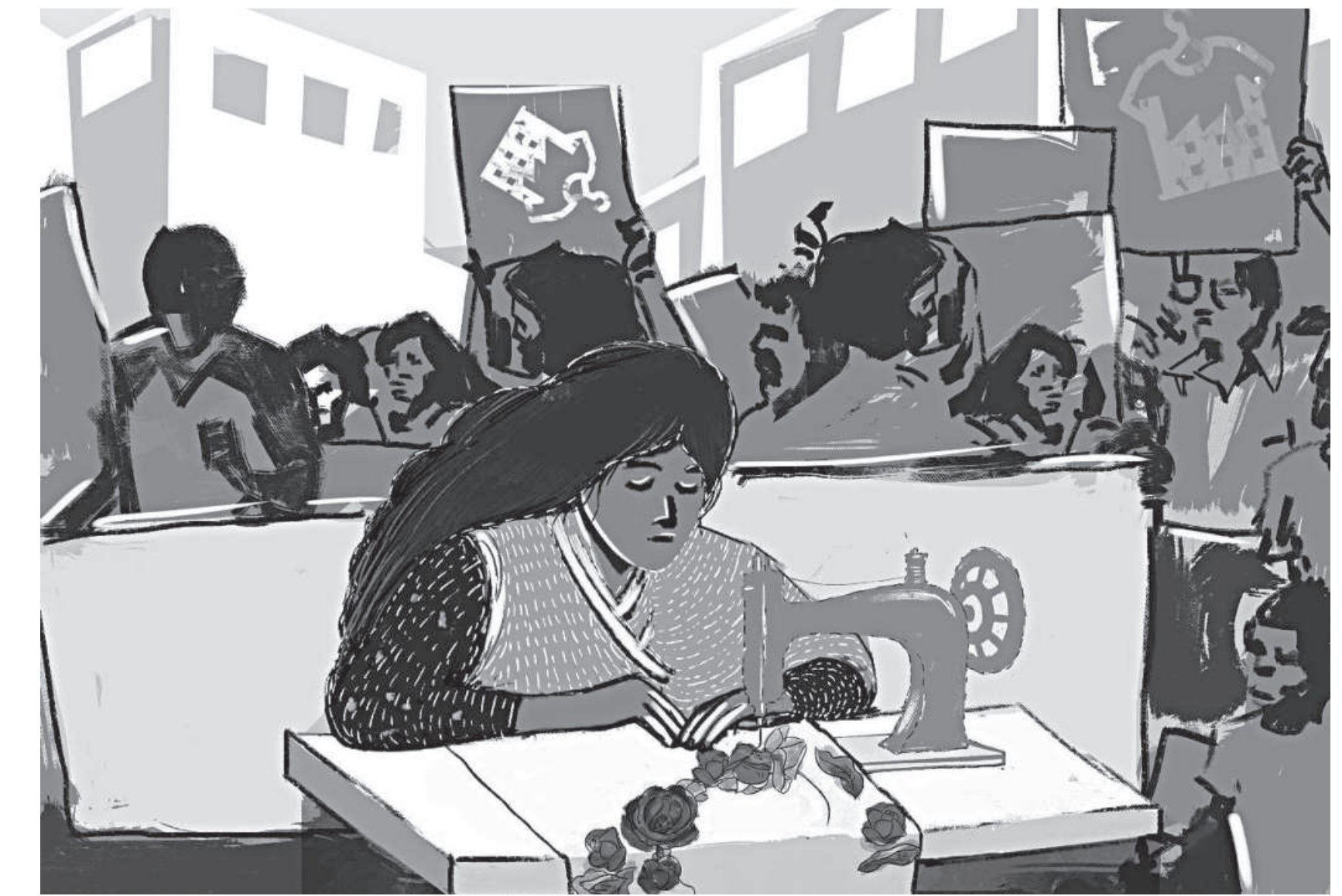
ILLUSTRATION: ANWAR SOHEL

Although RMG export orders bounced back once the corona situation improved, the workers' lives did not improve. The working hours in the factories increased, as did the production pressure. An amendment to the labour law now