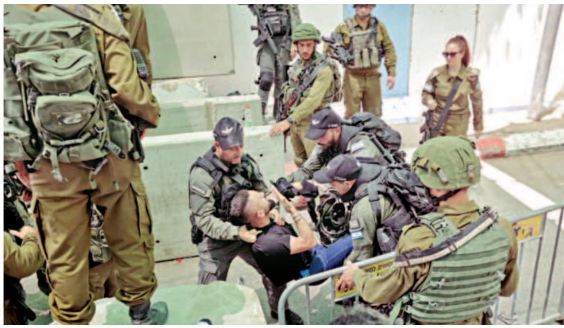
Israeli security forces evacuate a Palestinian man who was denied passage at a checkpoint to reach the city of Jerusalem to attend the last Friday prayers of Ramadan in the al-Aqsa mosque compound, yesterday, in Bethlehem in the occupied West Bank.