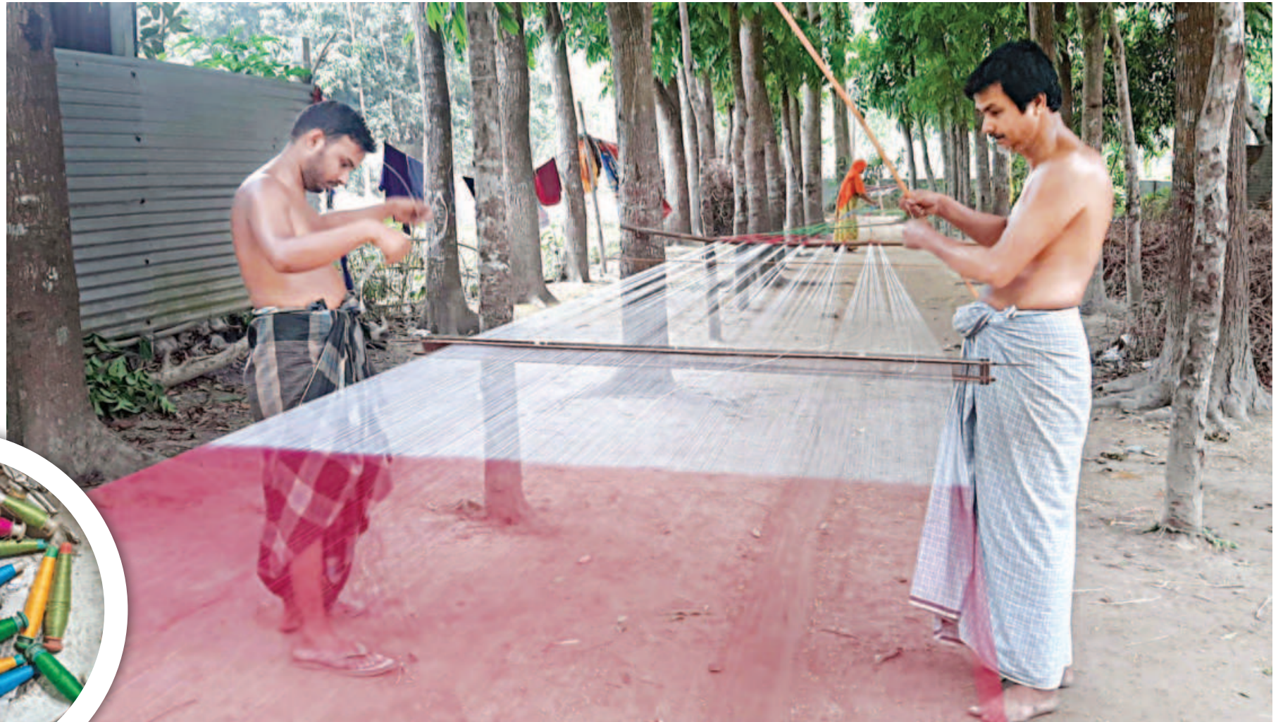
A weaver family of Pathrail in Delduar upazila are processing their yarn, readying themselves to weave the ever-popular Tangail sari. Pre-Eid preparations have kept them busy, after a long hiatus because of the pandemic. This photo was taken recently.

"If the demand for hand-loom products, including saris, increases, skilled weavers who have left the profession will return," he said, adding that government support is vital in this regard.