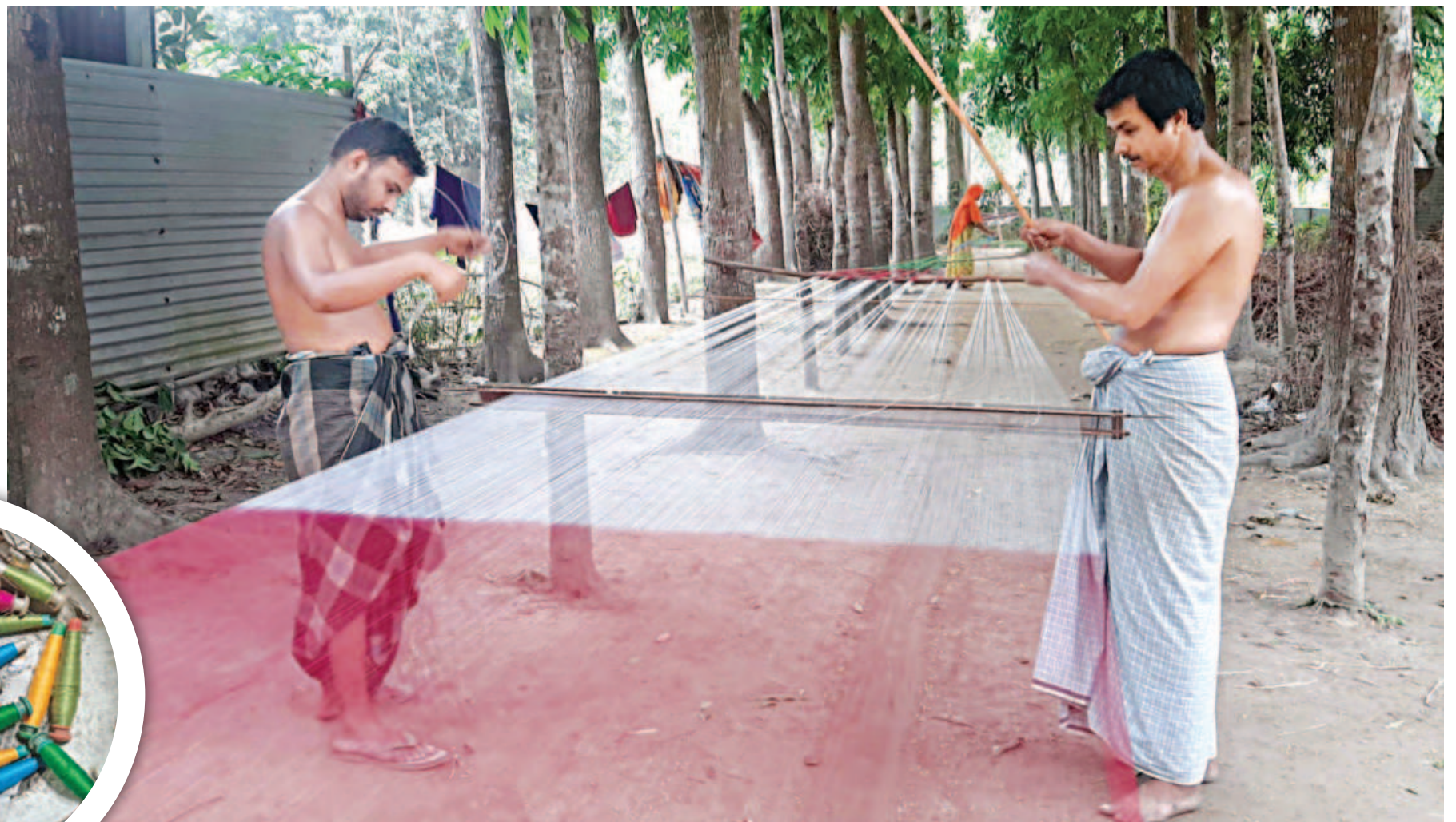
A weaver family of Pathrail in Delduar upazila are processing their yarn, readying themselves to weave the ever-popular Tangail sari. Pre-Eid preparations have kept them busy, after a long hiatus because of the pandemic. This photo was taken recently.

"If the demand for hand-loom products, including saris, increases, skilled weavers who have left the profession will return," he said, adding that government support is vital in this regard.