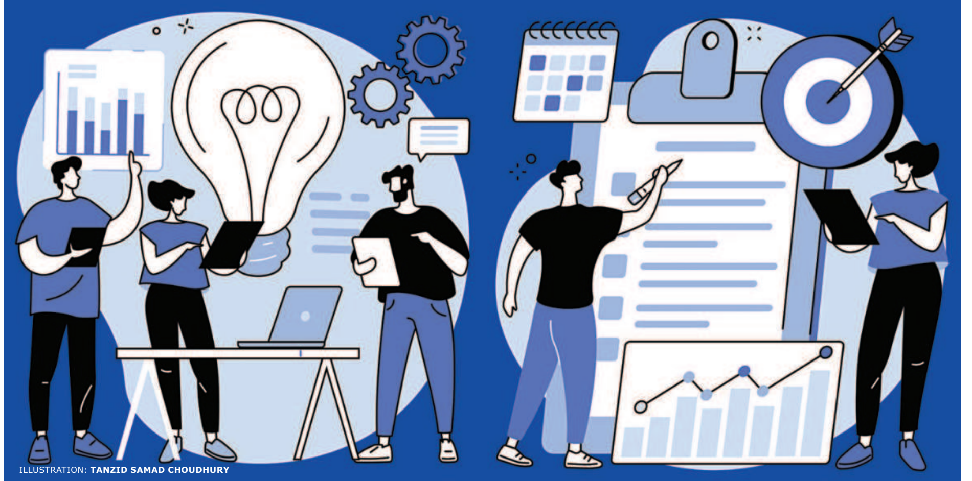
ILLUSTRATION: TANZID SAMAD CHOUDHURY

While it may be challenging to have to start from the bottom line, it is vital to gradually learn all the relevant skills. Have patience and take your time. Divide your learning goals into short steps. You will find it amusing just how fast human beings can adjust to new environments.