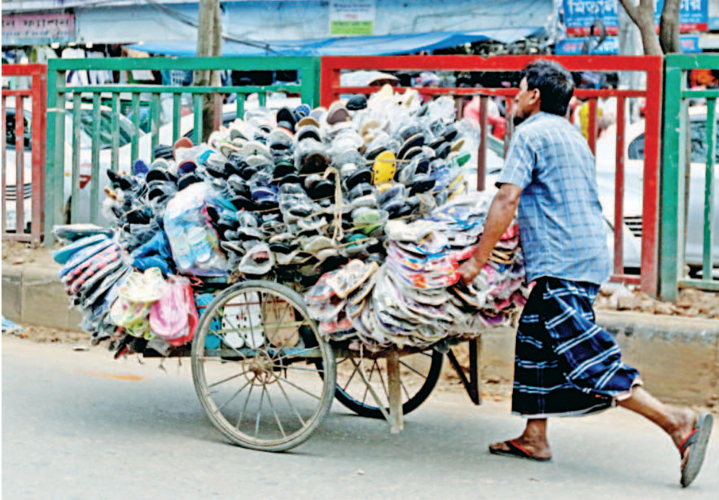
A vendor pushes his cart full of plastic sandals bought at wholesale in Chawkbazar of the capital keeping in mind the upcoming Eid-ul-Fitr and priced between Tk 50 and Tk 120. The photo was taken near the Science Laboratory intersection recently.

The maker of a vast amount of products including Magnum ice cream, Cif surface cleaner and Dove soap said revenue increased nearly 12 per cent to 13.8 billion euros ($14.5 billion) in the first quarter from a year earlier.