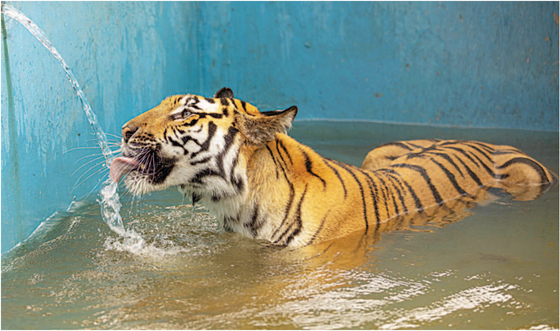
Tigress Joya drinking from a stream of water in a reservoir at Chattogram Zoo to quench her thirst in the unbearable summer heat yesterday. Several other animals at the zoo were seen jumping into their pools to cool down.

UNB, Dhaka Prime Minister Sheikh Hasina yesterday pledged to ensure houses for all homeless people in the country. "We have been able to ensure electricity for 100 percent people. Now 100 percent [homeless] people will get houses. None will remain landless and shelter-less in Bangladesh," she said. The premier was addressing a programme marking the handover of about 33,000 government-built homes to another batch of extremely poor families as her Eid gift under the third phase of the Ashrayan-2 project. She joined the event from the Gono Bhavan virtually. SEE PAGE 7 COL 2