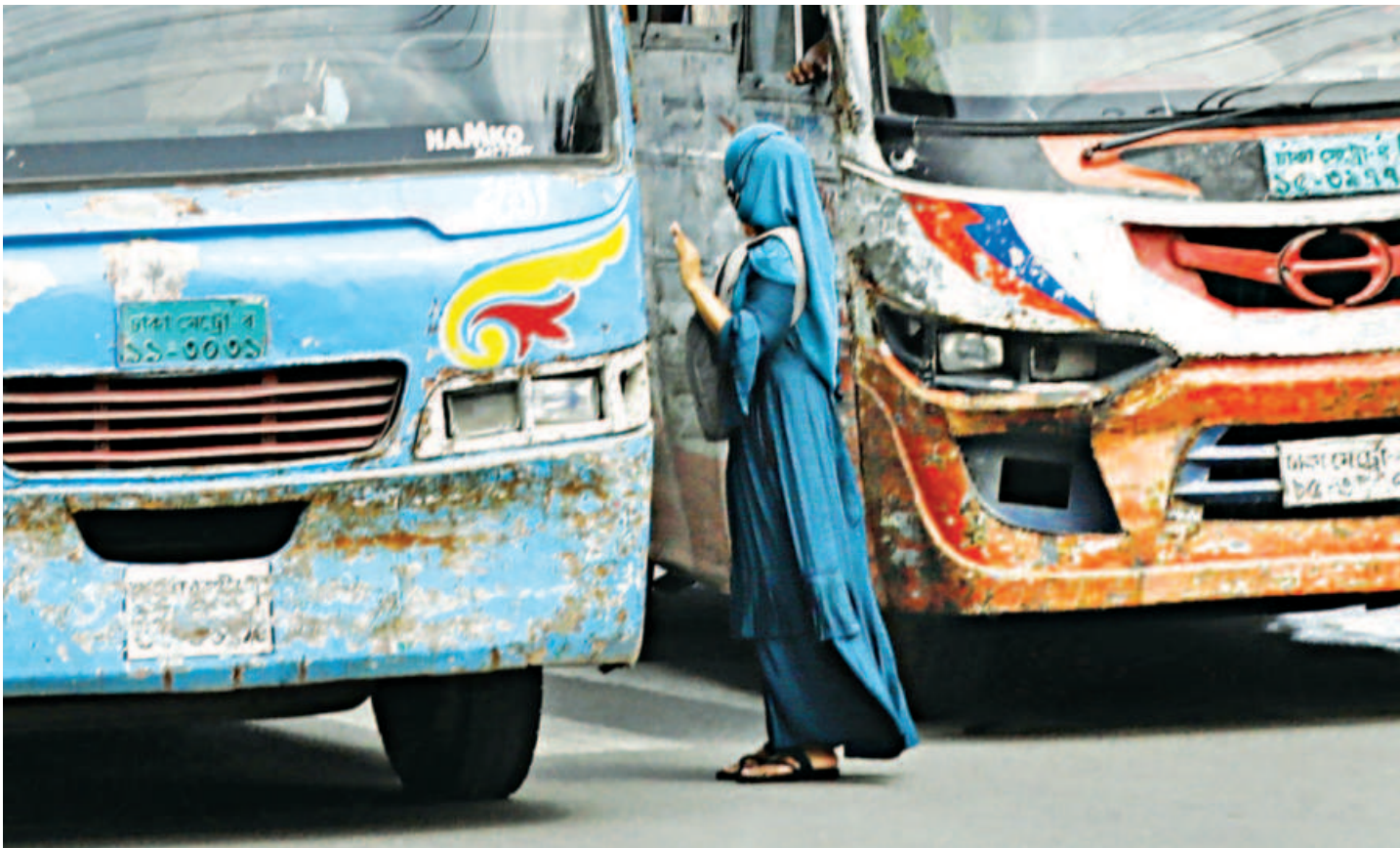
A woman callously tries to cross Manik Mia Avenue, one of the busiest streets in the capital, between two buses yesterday. Such jaywalking ignoring risks to one's safety often causes fatal accidents.