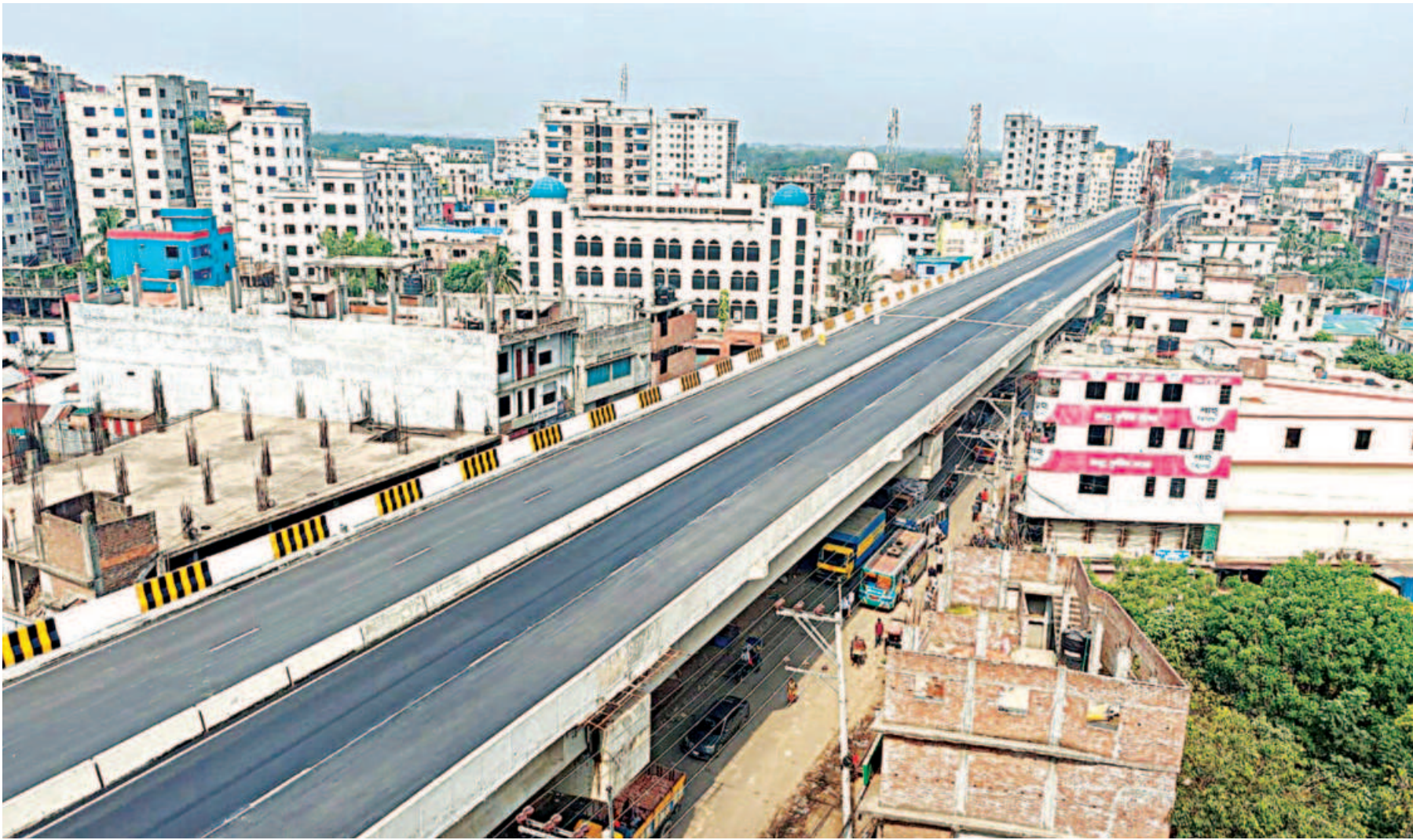
The 815-metre Naujor flyover in Gazipur was opened to the public around 2:00pm yesterday. The government made three flyovers, including this one, and a portion of a bridge operational to help smoothen the journeys of home-goers ahead of Eid. Related story on www.thedailystar.net