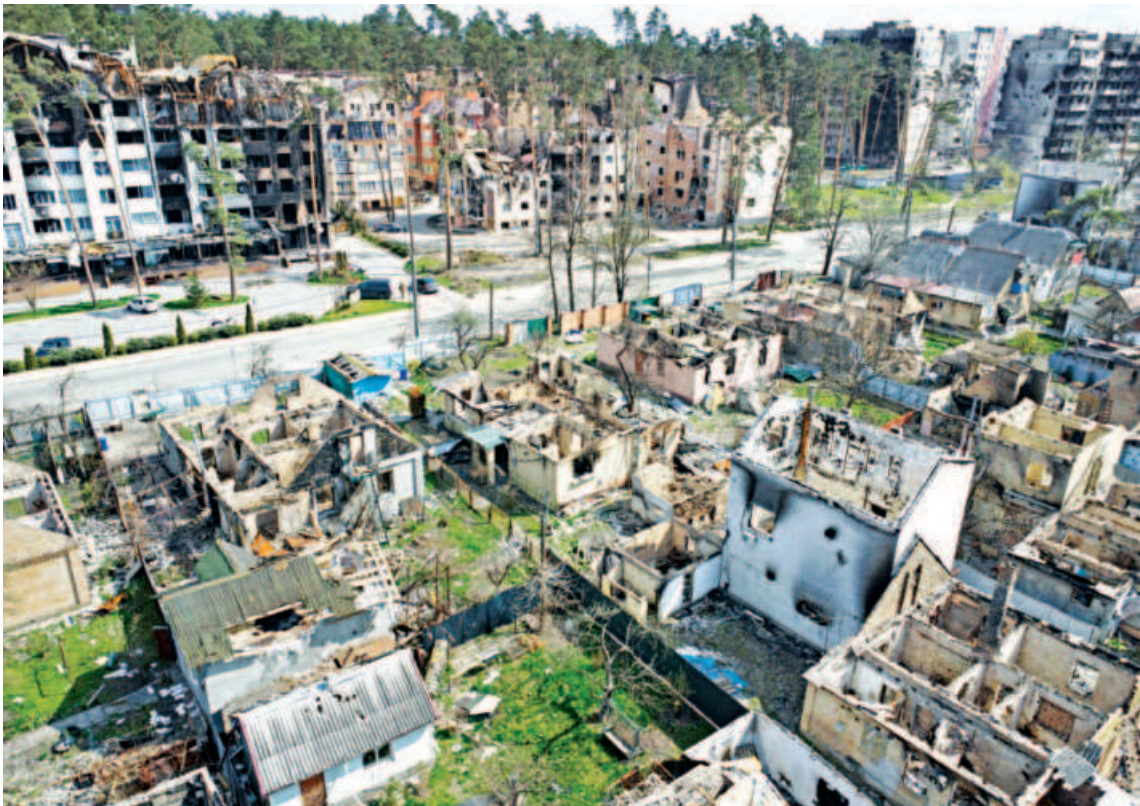
This aerial photograph taken on Sunday shows a destroyed residential area in Irpin, northwest of Kyiv, amid the Russian invasion of Ukraine.