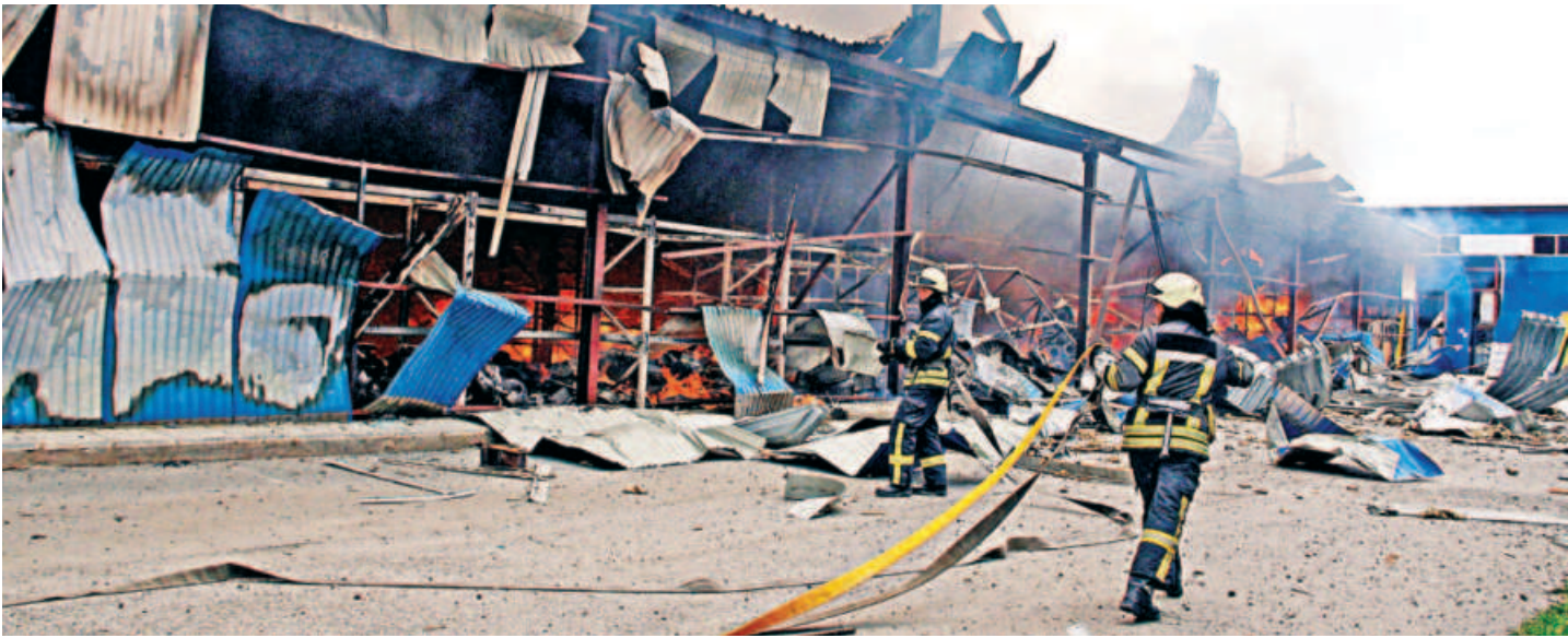
Firefighters work to extinguish a fire that broke out in a steel warehouse following a strike in Kharkiv, Ukraine, yesterday.