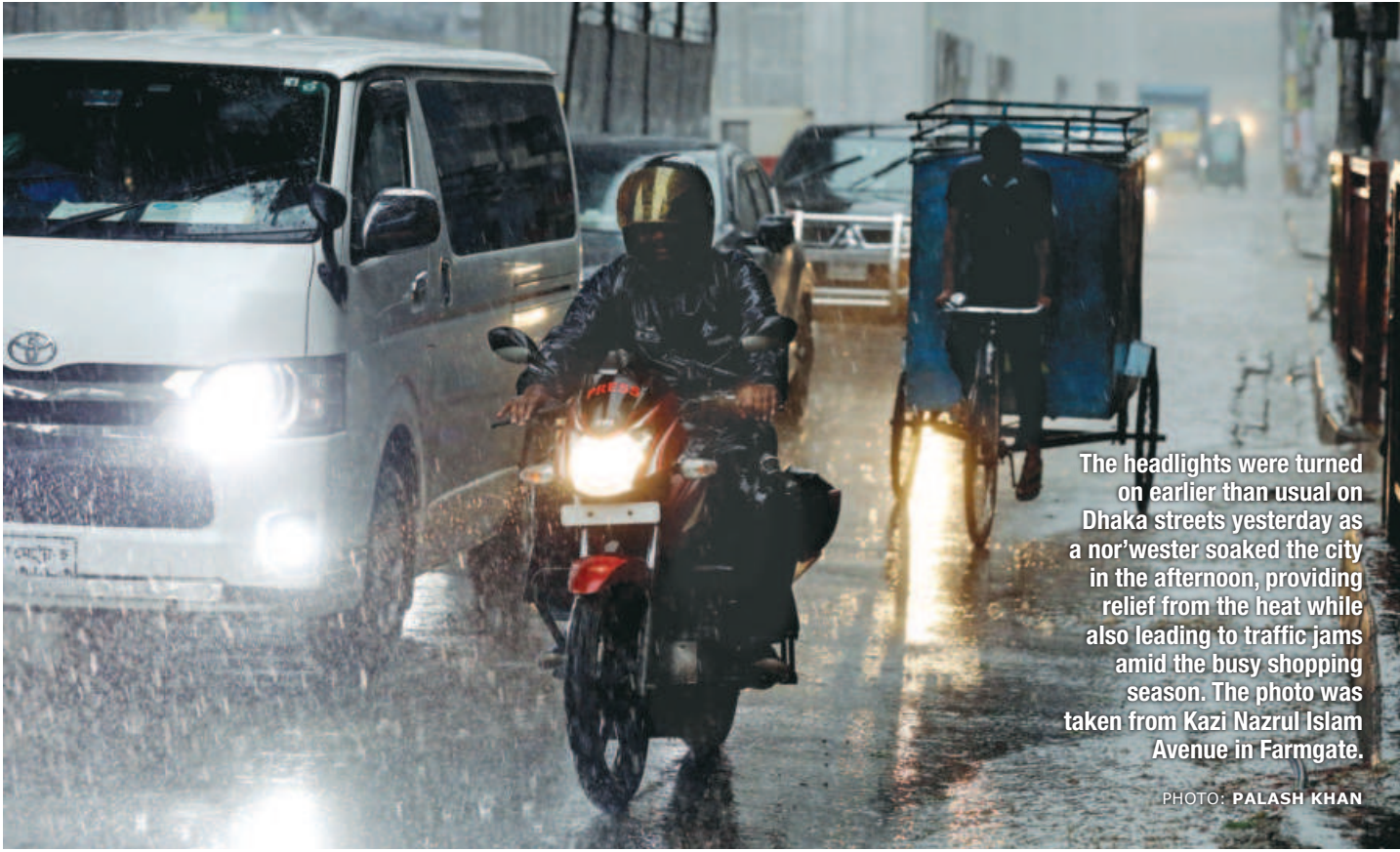
The headlights were turned on earlier than usual on Dhaka streets yesterday as a nor'wester soaked the city in the afternoon, providing relief from the heat while also leading to traffic jams amid the busy shopping season. The photo was taken from Kazi Nazrul Islam Avenue in Farmgate.