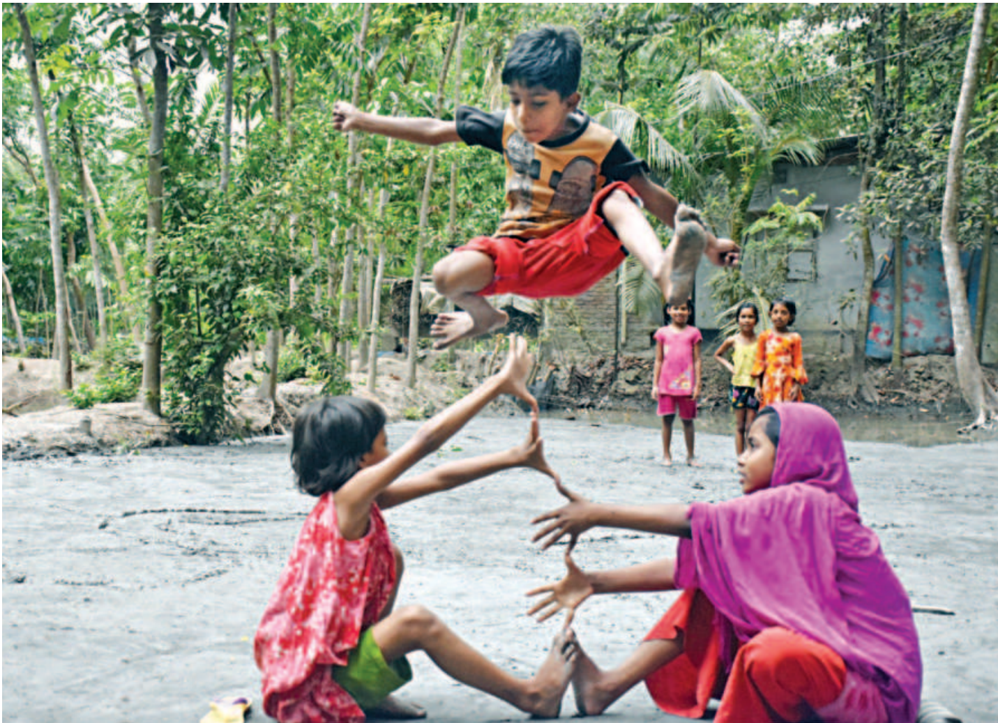
A boy performs a flawless high jump over the hurdle two of his friends have formed by linking their toes and fingers together at a homestead in Barishal yesterday. As school was closed on the weekly holiday, children were free to enjoy their games to their hearts' content.