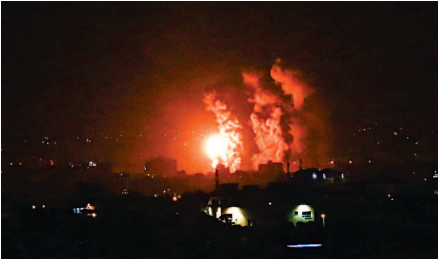
Flames and smoke rise during Israeli airstrikes central Gaza strip, yesterday. Palestinian militants fired volleys of rockets from Gaza into Israel, which responded with air strikes in the early hours of yesterday in the biggest escalation since an 11-day war last year. The exchanges come after nearly a month of deadly violence in Israel and the Palestinian territories, focused on Jerusalem's flashpoint Al-Aqsa Mosque compound, known to Jews as the Temple Mount.

Chinese President Xi Jinping proposes 'global security initiative'