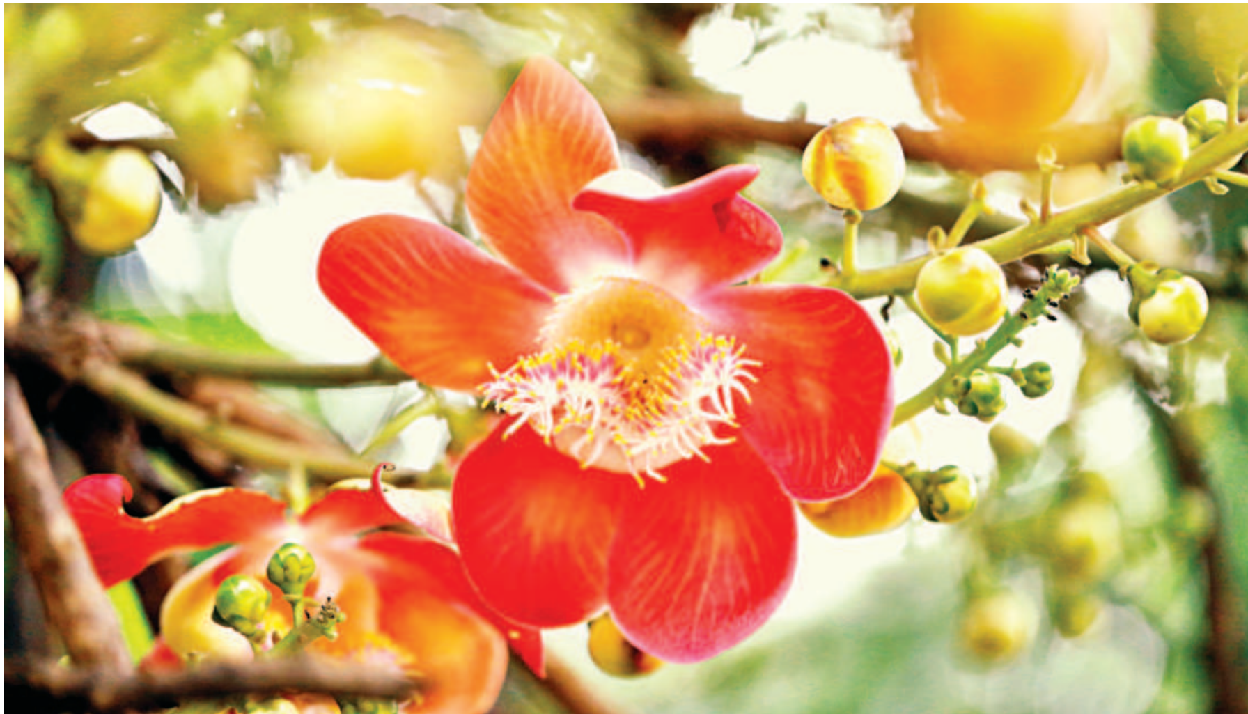
A bright red flower, with a touch of pink and yellow. Fully bloomed, the rare Nagalingam can fill anyone's heart with joy as it carries the colours of love, resistance and hope, all at once. This photo was taken at the capital's Suhrawardy Udyan yesterday.