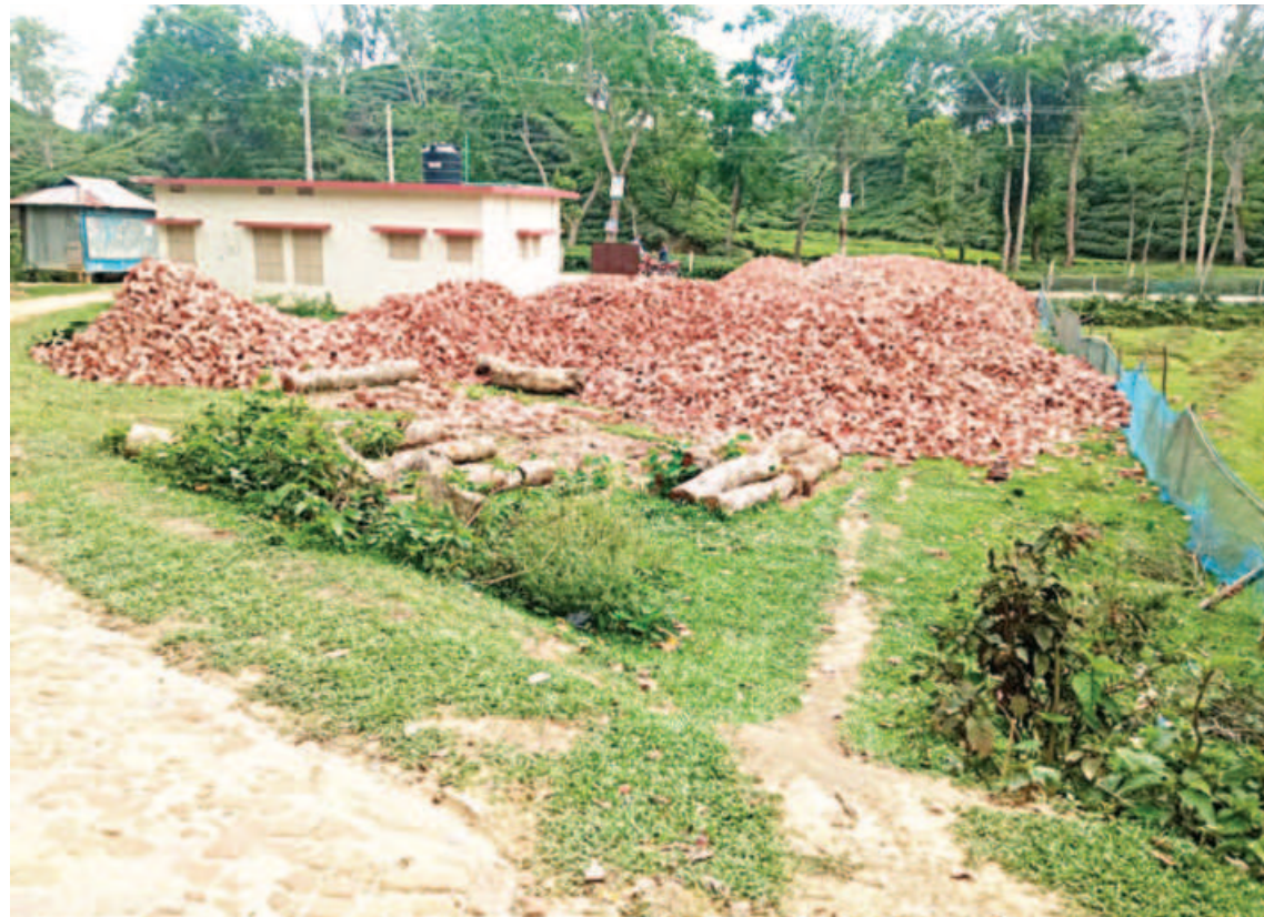
The road through Lathitila Protected Forest was being constructed under the initiative of LGED, without the forest department's approval. The construction is currently suspended after forest officials' intervention.