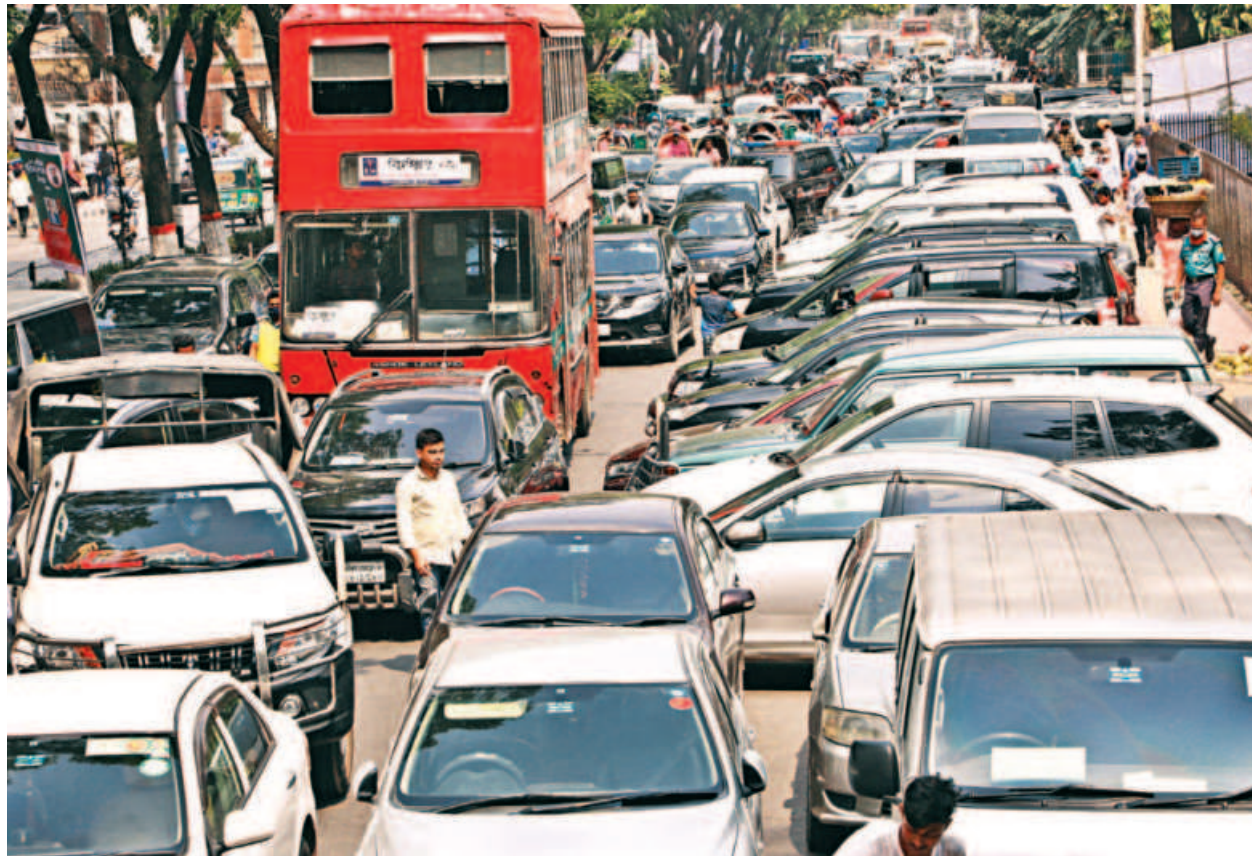
Vehicles parked on Abdul Gani Road right next to the Secretariat shrinks the space of the busy street. The illegal parking leads to traffic jam almost every day. The photo was taken a couple of days ago.