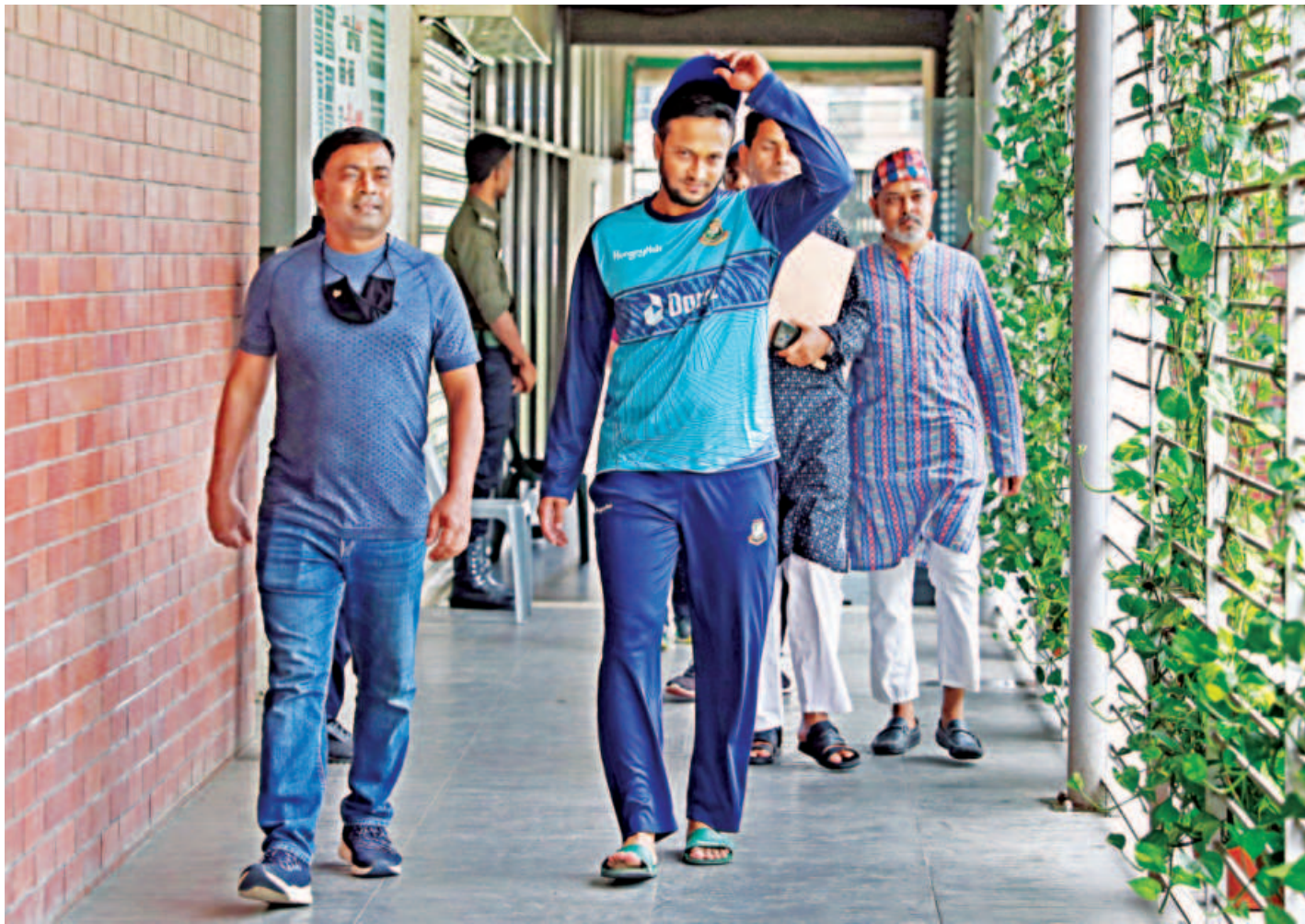
Shakib Al Hasan went to the Bangladesh Cricket Board headquarters in Mirpur yesterday, following his arrival from the USA earlier in the morning, to sign contract with Legends of Rugganj for the remaining four matches of the Dhaka Premier League. Shakib and other national team players, meanwhile, also signed central contracts with the BCB.