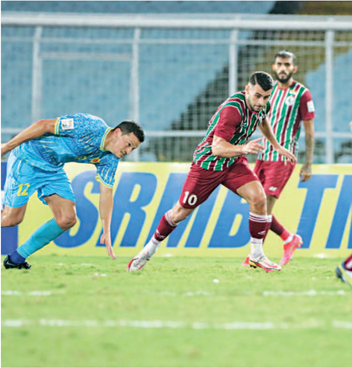
Mohun Bagan midfielder Hugo Boumos leaves Abahani playmaker Daniel Colindres in his wake during their AFC Cup Playoff fixture at the Salt Lake Stadium in Kolkata on Tuesday. The hosts won the contest 3-1 to book a place in the group stages of the competition.

Liton Das was attending a program for SG and talking to the press, when the news of Rubel's death came in yesterday. Immediately a dark cloud came over Liton as he struggled to come to terms with the news. "You have given me a very saddening news," Liton said. "I played with boro bhai for a long time and I will always remember wherever I have played with him," Liton reminisced before falling silent as he tried to gather himself. That was the love that Rubel garnered in Bangladesh's cricketing fraternity. "He was a wonderful human being. Not many know of his sense of humour, but we know," selector Habibul Bashar told The Daily Star yesterday. "In our addas, he was the one with the jokes and humour. There was a time when we spent so much time together. Probably in 2007 or 2008, we used to go roam around and find various restaurants to eat at in the evenings. His cricket career should have been a lot bigger because he was a genuine all-rounder. It's difficult to talk about him, he was always missed and will be missed now. I know he was suffering a lot. It was difficult for me to watch him since I was so close to him. I couldn't take it. Those who got to spend time beside him or played with him will tell you that they don't know someone as charming as him," an emotional Bashar said.