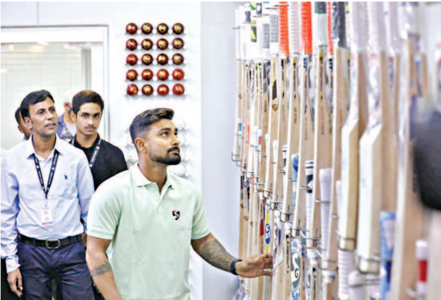
Bangladesh batter Liton Das inspects a few willows during the inauguration ceremony of a cricket equipment sales centre in Dhanmondi yesterday. Liton, who has played two matches for Abahani in the Dhaka Premier League after returning from South Africa, will look to make his willow talk during the remaining Super League matches.