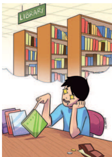
ILLUSTRATION: OISHIK JAWAD

The most useful subscription is their Digital Library plan, which offers more than 80,000 resources on the go. For an individual membership of one year for the Digital Library, you get access to all the digital journals, e-books, e-magazines, e-movies, e-newspapers, learning modules, digital graphic novels and more. From JSTOR to The Economist, you get access to all resources on an app for a yearly fee of