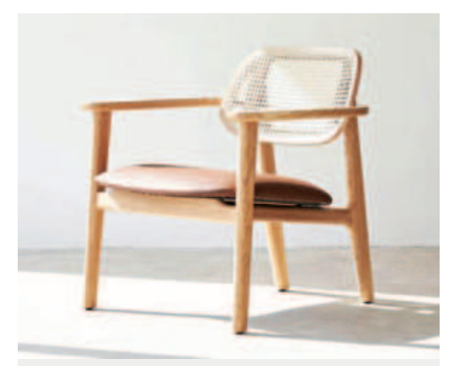
Savoir is known for tasteful and minimalist designs.

our ways and landed a spot among the top 4 ventures getting seed funding with the option of an additional amount as scale-up funding through funding round presentations, among other beneficial hands-on training methods.