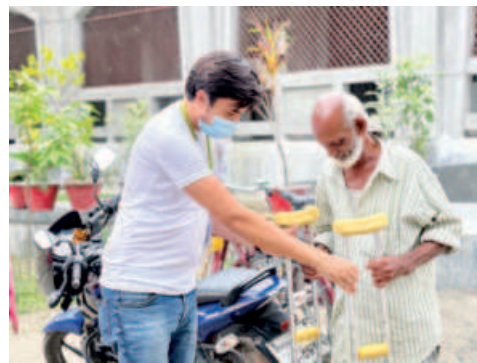
Volunteering teaches people empathy, compassion, and a sense of responsibility.

Networking and making new friends is another advantage of volunteering. "When I started communicating with different