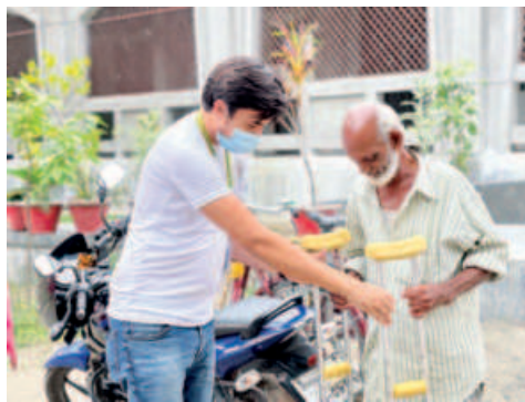
Volunteering teaches people empathy, compassion, and a sense of responsibility.

Networking and making new friends is another advantage of volunteering. "When I started communicating with different