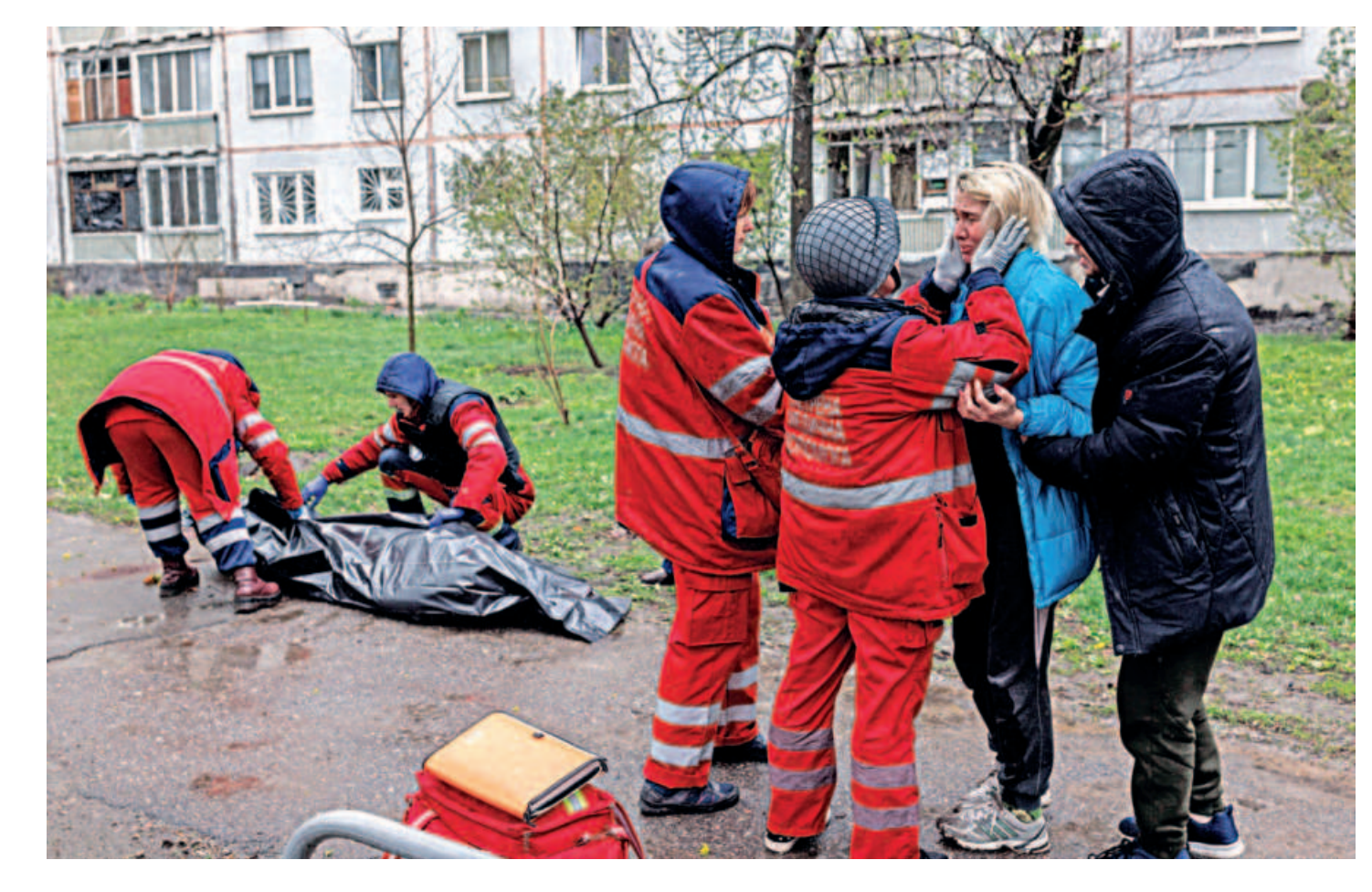
A woman mourns as medical workers retrieve the body of her father, following Russian shelling, as Russia's attack on Ukraine continues, in Kharkiv, Ukraine yesterday.