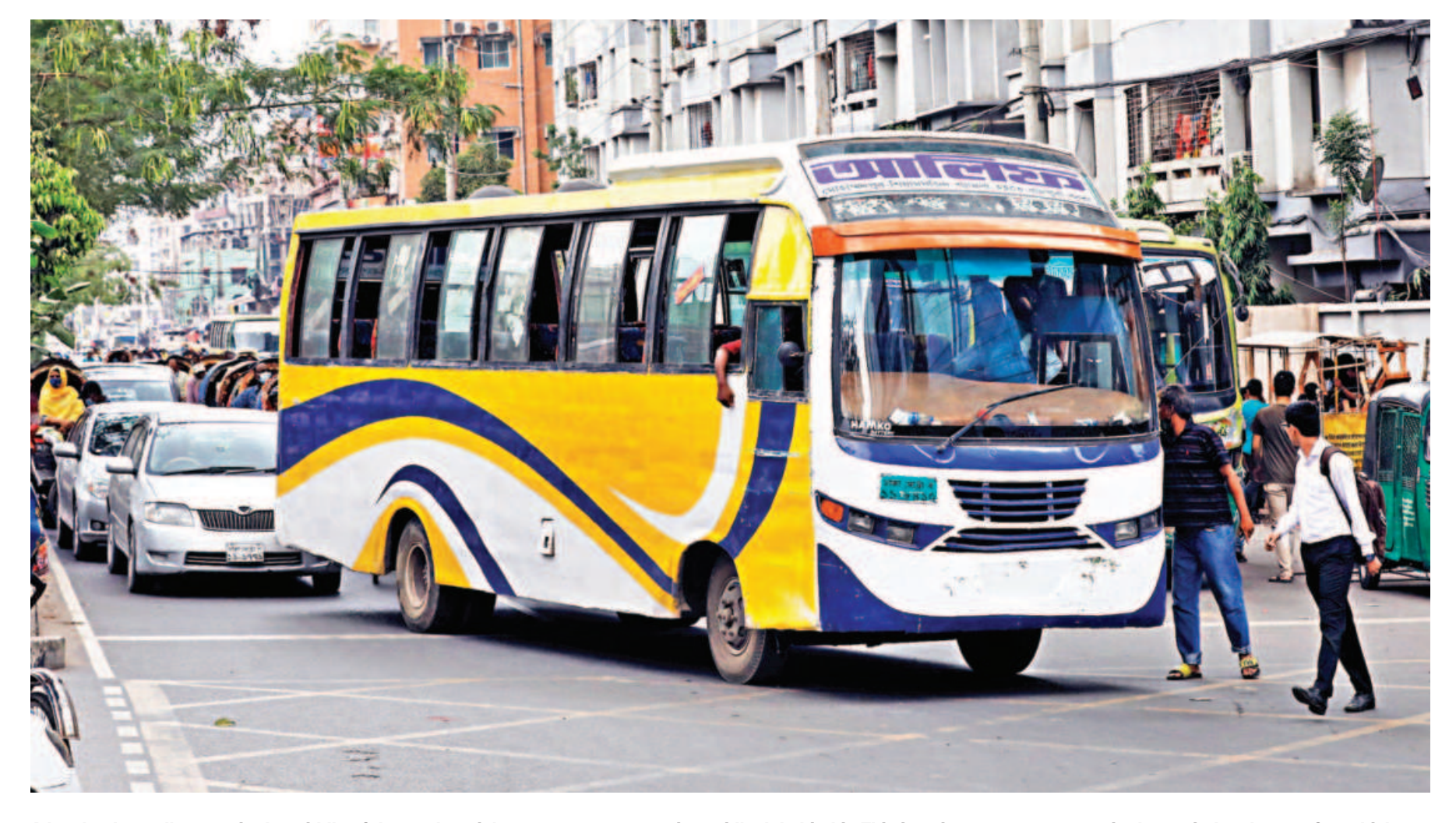
A bus haphazardly stops in the middle of the road to pick up passengers, causing gridlock behind it. This is quite a common scene in the capital and cause for vehicle clogging on the roads. Bus drivers continue to pick up passengers in an extremely risky manner, stopping at almost any empty space they can find. This photo was taken on Mohammadpur Ring Road, in front of Japan Garden City yesterday.

The EC started holding talks on March 13, when they sat with academics. It sat with eminent citizens on March 22 and with senior journalists of newspapers on April 6.