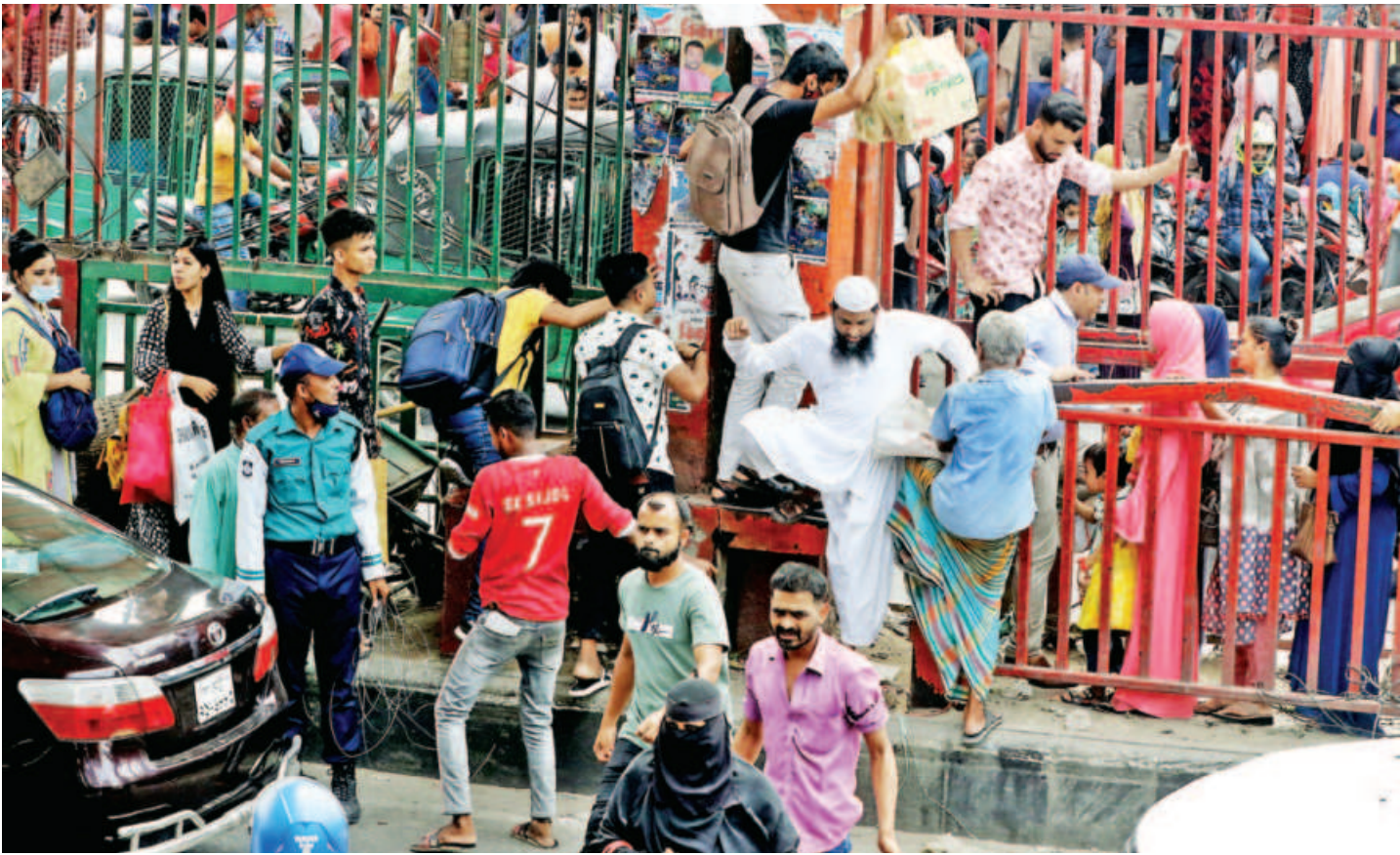
In front of New Market yesterday, this photojournalist witnessed a precarious scene that one can only come across in a chaotic city like Dhaka. Despite a new foot-over bridge just near the presently closed one overhead, shoppers have decided to get across the traffic heavy road by squeezing through the dividers. Meanwhile, a traffic policeman who went there to control the situation, stares at the crowd gathered on the fence in dismay.