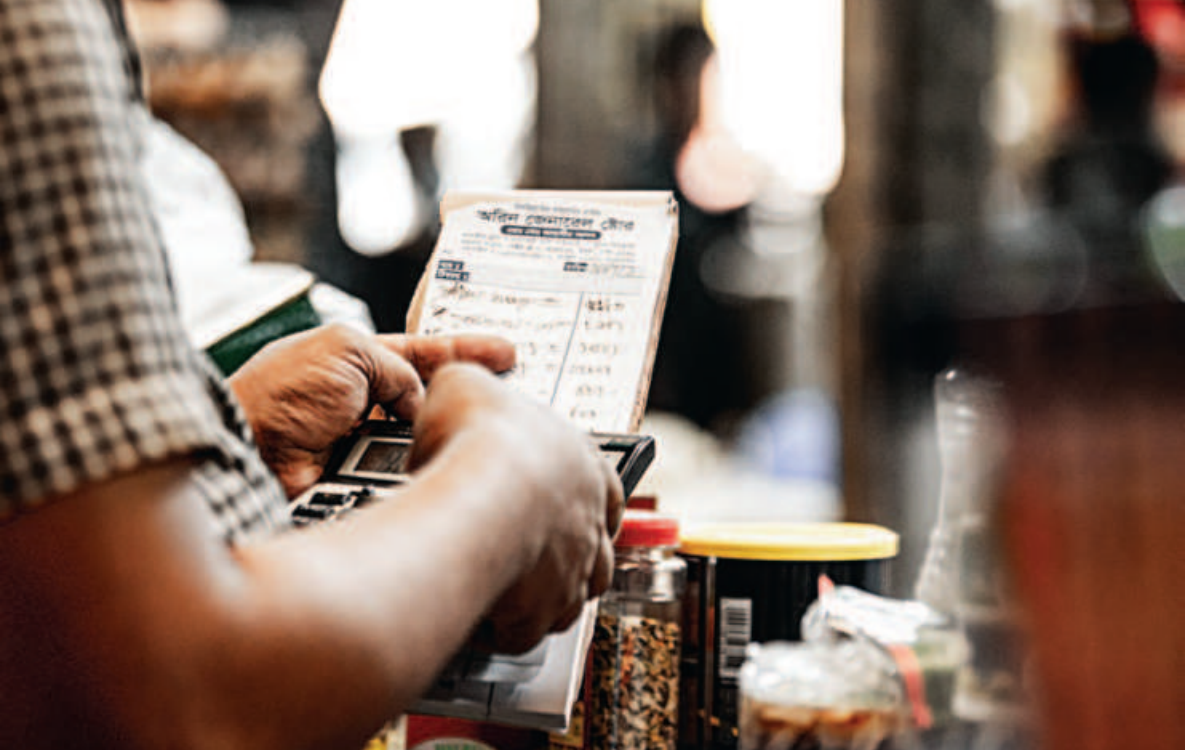
With the prices of daily essentials soaring during Ramadan, lives of people are getting increasingly harder. Moreover, the fallout effect of pandemic has reduced their disposable income, which makes the brunt even heavier to bear. This photo was taken in Karwan Bazaar recently.

Local Government, Rural Development and Co-operative Minister Md Tazul Islam yesterday said action will be taken if applicants are harassed while trying to make or correct birth registration certificates. He said this while talking to the media. The minister said, “At any level, if people are harassed in any way, no one will be spared. Birth registration is now a burning issue for us. That’s why I’ll definitely take action if this happens. We met today to discuss how to make this process simpler and easier so that no one is harassed.”