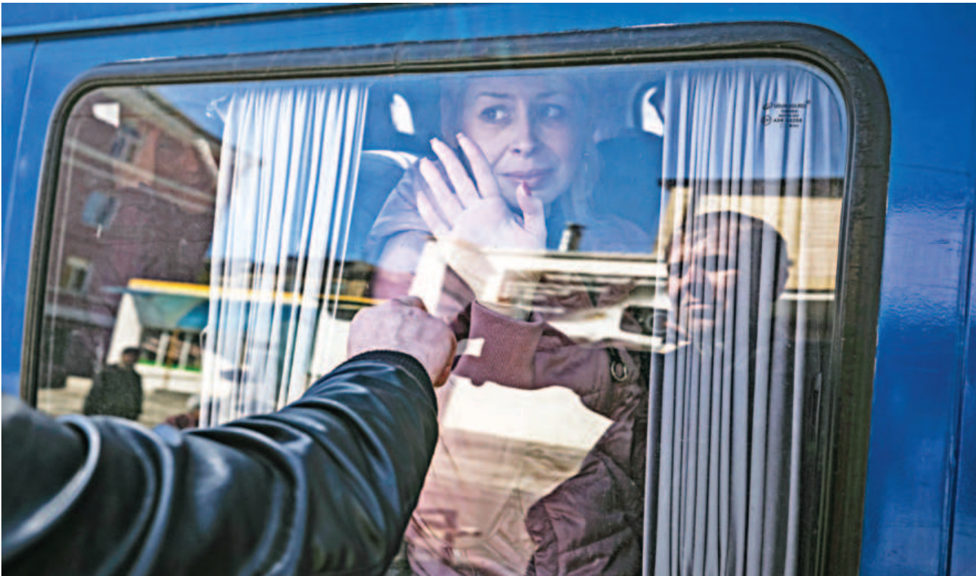
A woman waves to say good bye to her husband as she leaves on a bus, a day after a rocket attack at a train station in Kramatorsk, Ukraine, yesterday. Evacuations resumed yesterday from the town in eastern Ukraine where a missile strike killed 52 people at a railway station as civilians in the east of the country fled a feared Russian offensive.

AFP, Jenin Israeli security forces raided the flashpoint West Bank district of Jenin yesterday killing a Palestinian and wounding 12 others, after vowing there will “not be limits” to curb surging violence. The operation, which lasted several hours, came after a gunman from Jenin went on a shooting rampage in a popular Tel Aviv nightlife area on Thursday evening, killing three Israelis and wounding more than a dozen others. Following the attack, Israeli Prime Minister Naftali Bennett gave security agencies “full freedom” to end deadly violence that killed 14 people since March 22. Over the same period, at least 10 Palestinians have been killed.